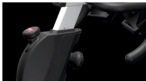
MAINTENANCE FREE MAGNETIC BRAKE SYSTEM WITH 300-DEGREE RESISTANCE DIAL