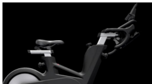
SUPERIOR 4-WAY ADJUSTMENTS ENSURE A FINELY TUNED FIT FOR ALL RIDERS