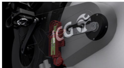
WATTRATE® POWER METER TO DISPLAY THE EFFORT IN WATTS WITH A HIGH ACCURACY