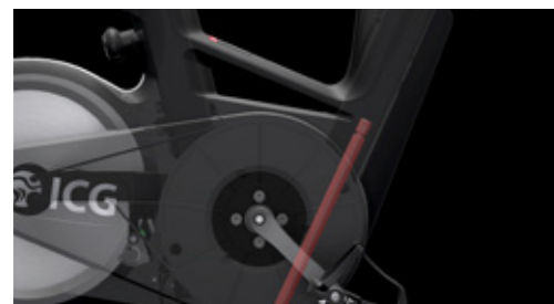
INTEGRATED HANDLEBAR USER ASSIST SYSTEM TO ENSURE AN EASY BIKE SETUP