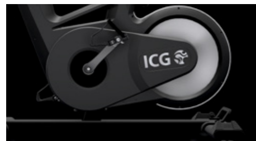
FULL COVER SHROUD AND POLY-V BELT DRIVETRAIN SYSTEM FOR SUPER SILENT RIDING