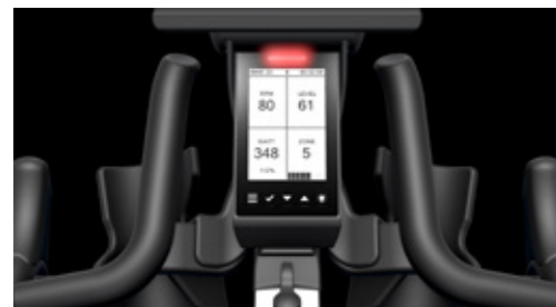
WATTRATE® LCD COMPUTER WITH COACH BY COLOR® AND CONNECT TECHNOLOGY