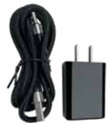
Cable & power adapter