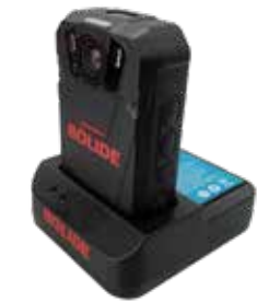
Single docking station (Charge at the same time Bodycam + Battery)