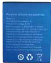
Battery the 3.8V (3050mAh / 11 hours)