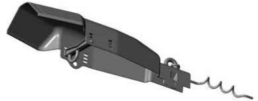
Large Conductor Applications