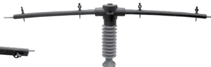
Horizontal Post – Top View