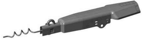
Small Conductor Applications

Materials: The RAPTOR PROTECTOR is manufactured from low density polyethylene (LLDPE) possessing excellent environmental stress crack resistance and is fully UV stabilized.