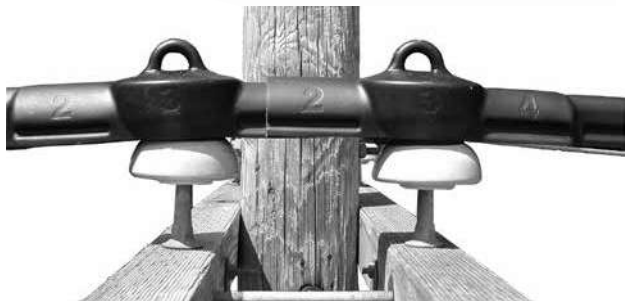
RPC-0800 – Double Support