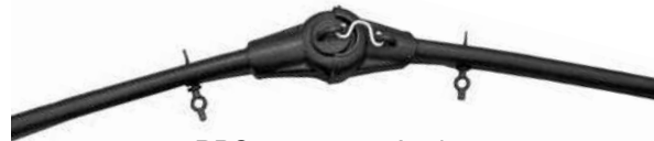
RPC-0810 – 30° Angle