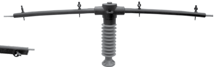
Horizontal Post – Top View