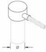
GR (ONE SHOT)