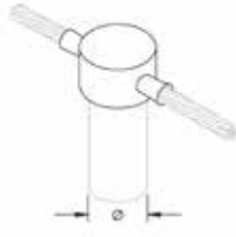
GT (ONE SHOT)