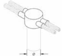
NX (ONE SHOT)