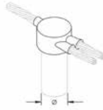
NT (ONE SHOT)