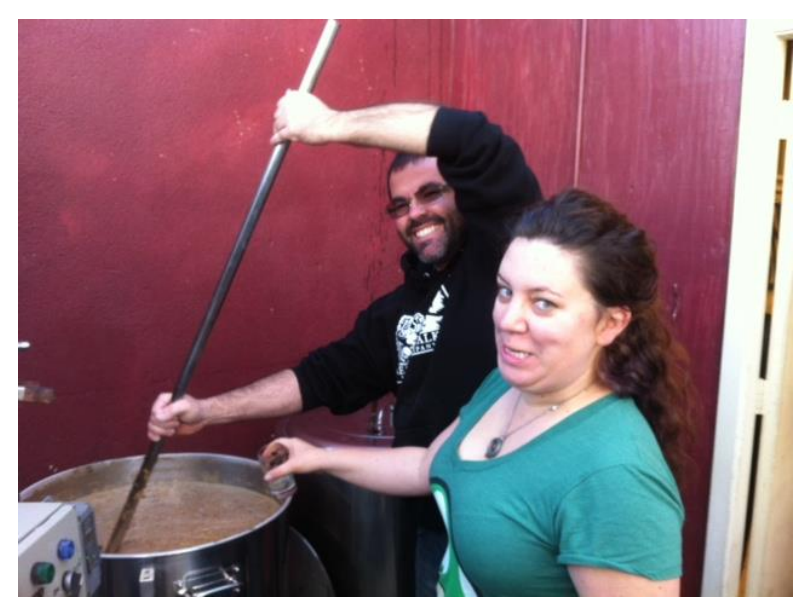
Boil for 90min. Follow Hop Schedule (see above)