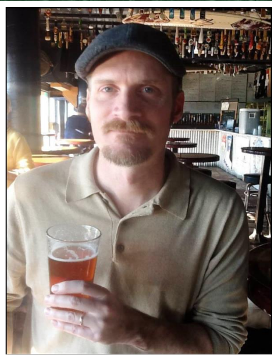
mugs, but we will all get a chance to have a good look at it.

If you have never been, the Anchor party and SF trip is a beer geek's fantasy. The Anchor Brewery is beautiful and they are gracious hosts. They even have a really nice view of downtown. Their tasting room is roomy and comfortable, with many taps pouring their delicious brews. We'll have the Falcons' band there to do a couple of sets and we'll raise a toast with the club of the year trophy. This trophy is a unique treasure, fashioned from extra copper parts from the Anchor brewhouse. The copper mug holds a generous, pass-around, quart of beer and it sits atop a tiered oak pedestal that bears the names of the past winners, similar to the Stanley Cup (but to my mind much more coveted). It is my hope to sip a bit Anchor Porter out of this grandest of beer