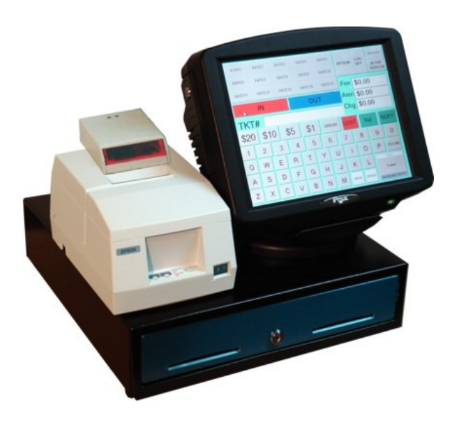
FC-4020 Touch Screen Fee Computer