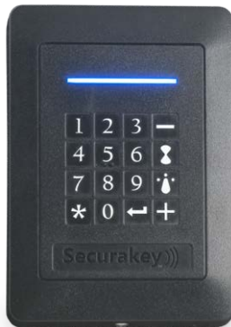
ET-SR-R-K Reader with Keypad