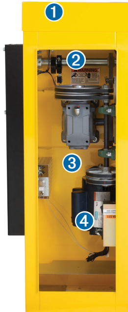
Model BGUS shown with optional thermostatically controlled heater