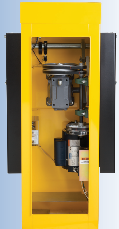
SG & SG-D Wishbone style arm 16'-25' long 115 or 230 VAC