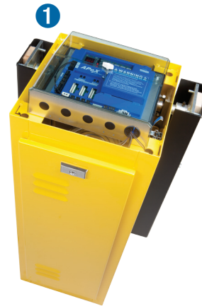
Model SG top view