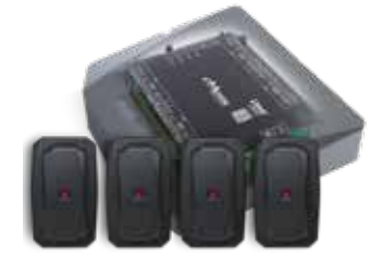
ES-4MB/ES-4MPB / ES-4CB