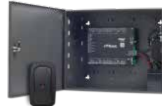
ES-1MB / ES-1CB