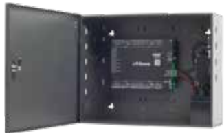
ES-1M / ES-1C