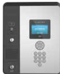
EP-436 / EP-402