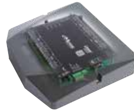
ES-4M/ES-4MP / ES-4C