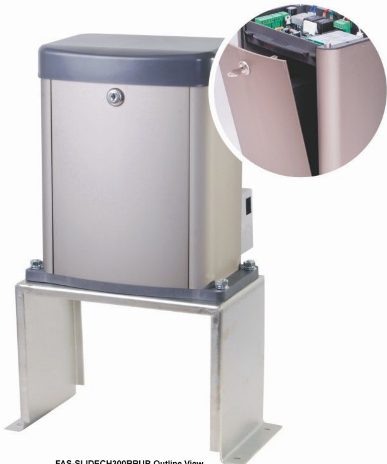
FAS-SLIDECH300BBUP Outline View

Sliding gate operator, Max. gate weight 300kg, chain driven