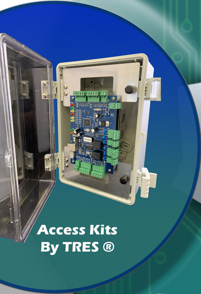
Access Kits By TRES®