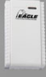
EG650 & EG652