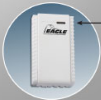
• Learning Button