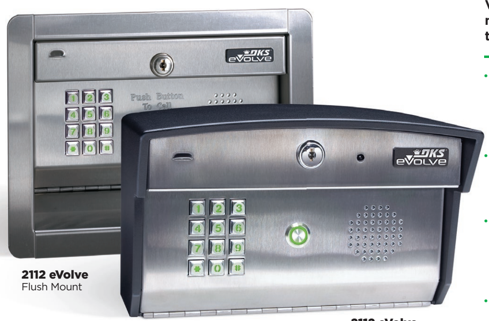
2112 eVolve Surface Mount