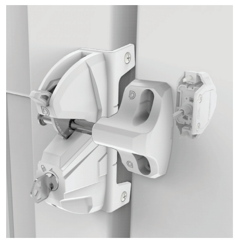
AVAILABLE IN WHITE