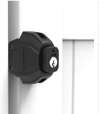
KEY LOCKABLE EXTERNAL ACCESS BUTTON