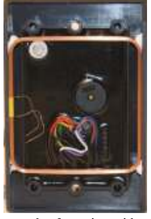
2. KP-6840 base reader, front view, with sockets for pins.