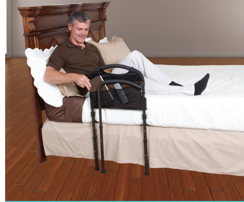
ORGANIZER KEEPS ITEMS CLOSE BY