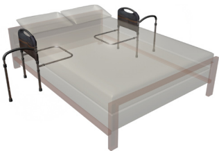
Adjust base tubes to accommodate left or right side of bed