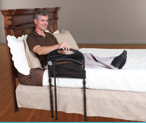
EASILY SIT UP IN BED