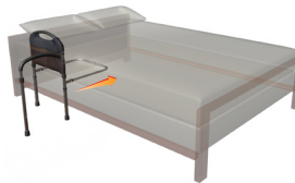
Insert base tubes between mattress and box spring