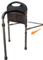
Attach base tubes to main handle