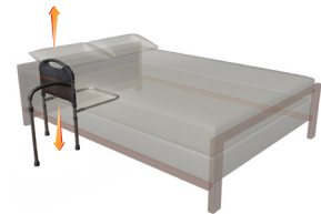
Adjust height of handle and legs as desired