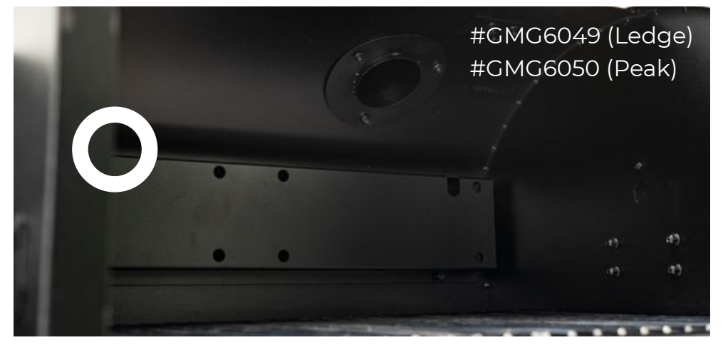
RACKT Module - Backboard