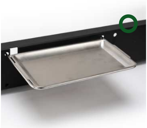
RACKT Module - Griddle