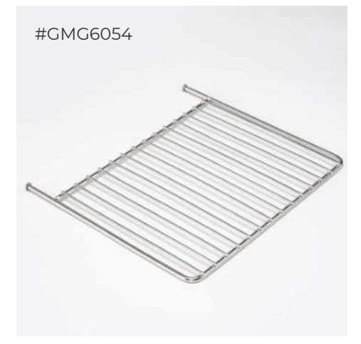
RACKT Module - Warming Rack