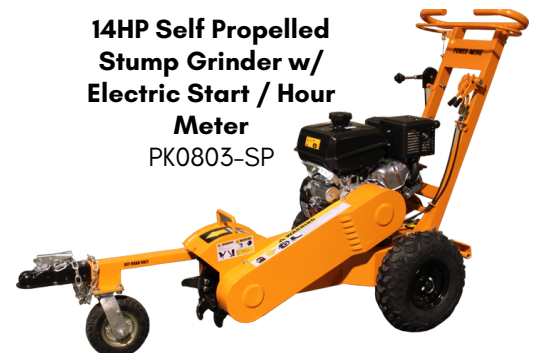
14HP Self Propelled Stump Grinder w/ Electric Start / Hour Meter PK0803-SP