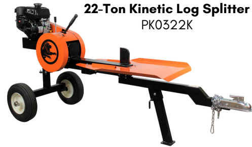
22-Ton Kinetic Log Splitter PK0322K