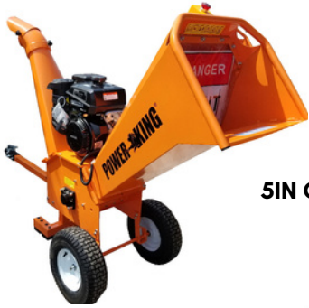
5IN Chipper Shredder w/ Electric Start PK0915-EH