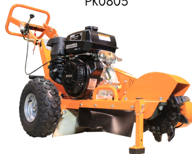
14HP Stump Grinder PK0803