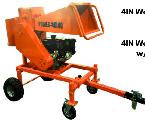
4IN Wood Branch Logger PK0921