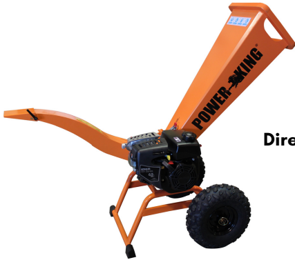
2.8IN Residential Direct Drive Chipper Shredder PK0913DD