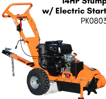
14HP Stump Grinder w/ Electric Start / Hour Meter PK0803-EH