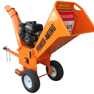
4IN Commercial Chipper Shredder PK0903