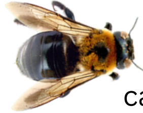
large carpenter bee