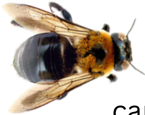
large carpenter bee