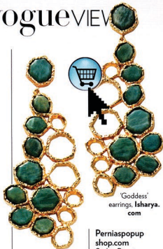
'Goddess' earrings. Isharya.com