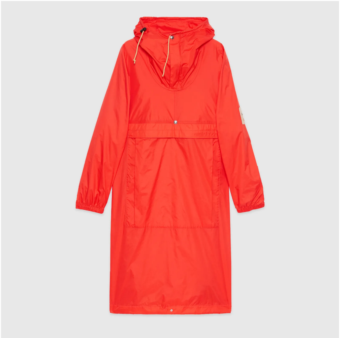
The North Face X Gucci