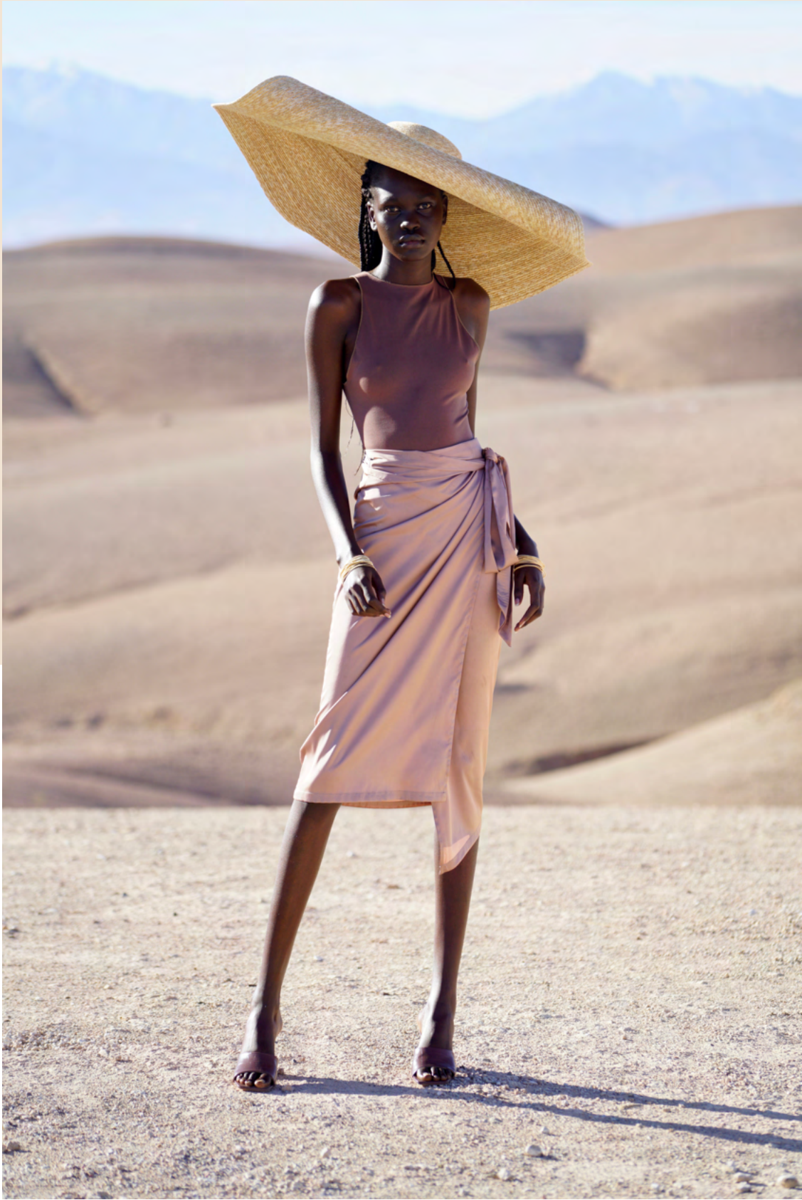
ALYA Silk Skirt