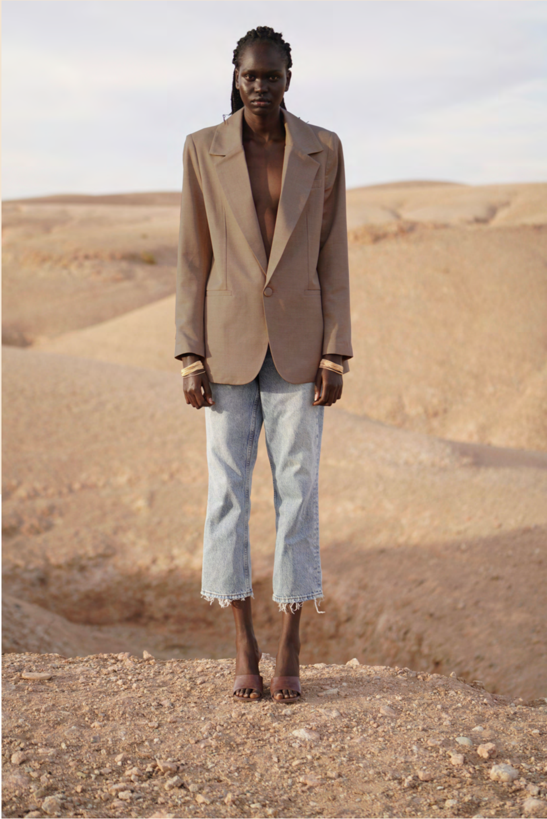
COCCO Oversized Wool Blazer