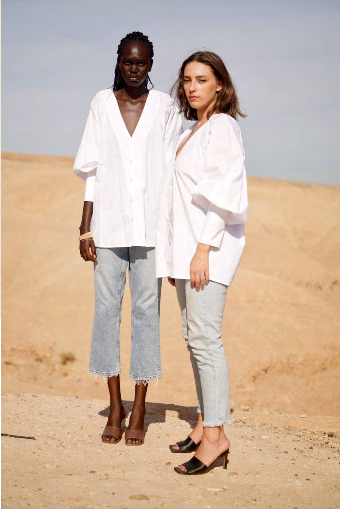
LIMA Oversized Cotton Shirt