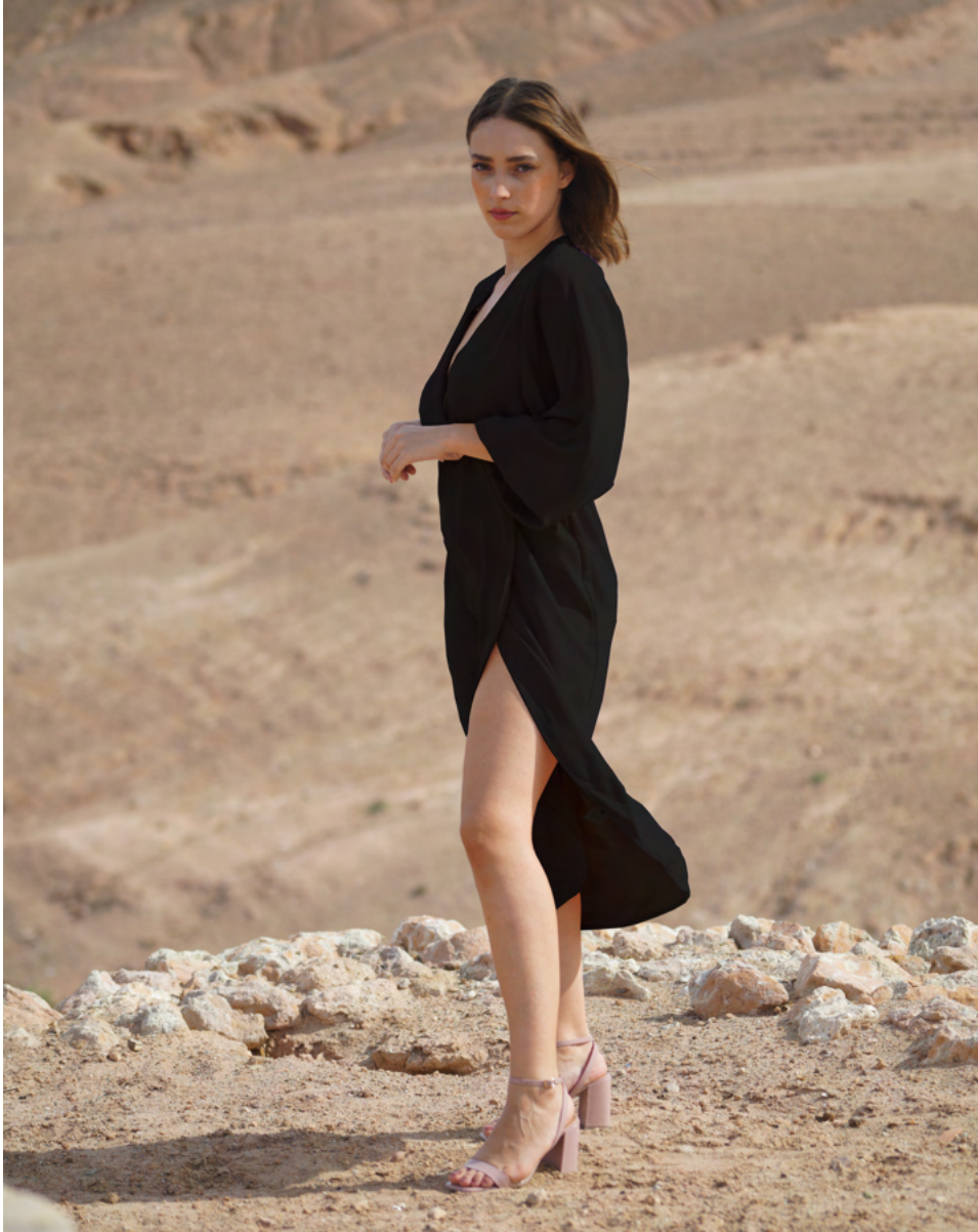
BELEM Silk Dress