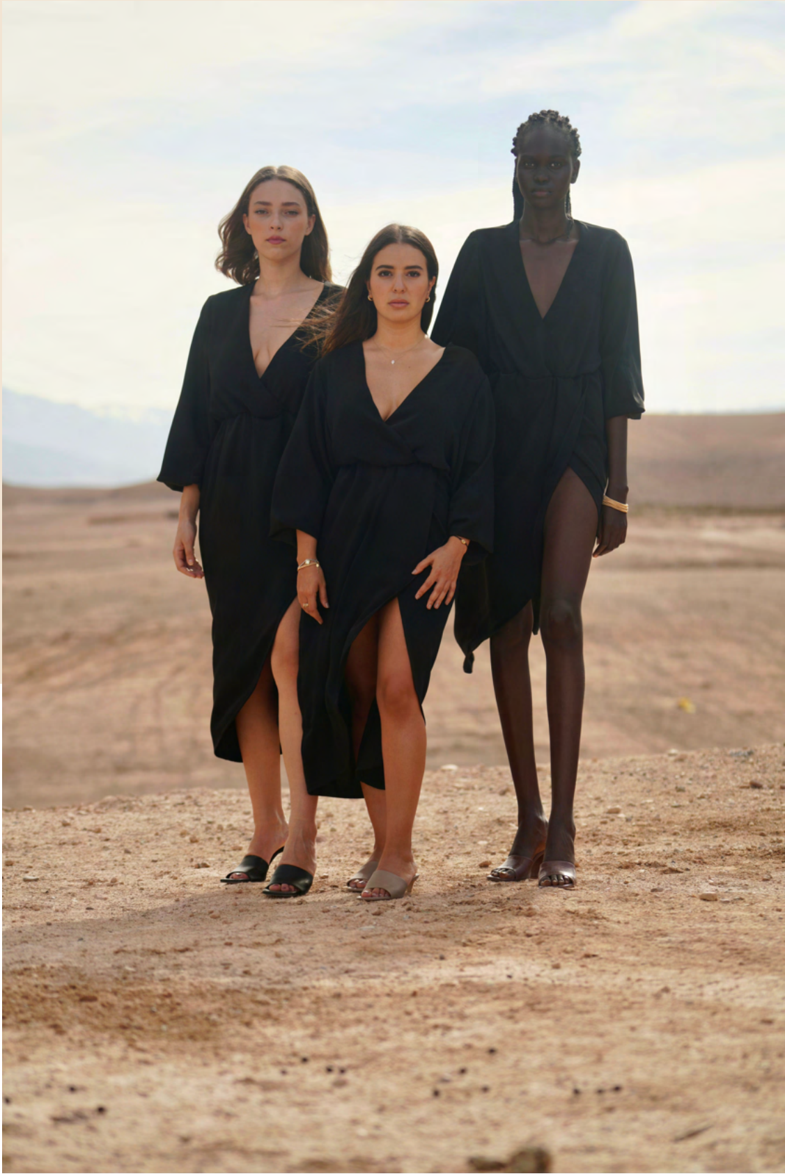
BELEM Silk Dress