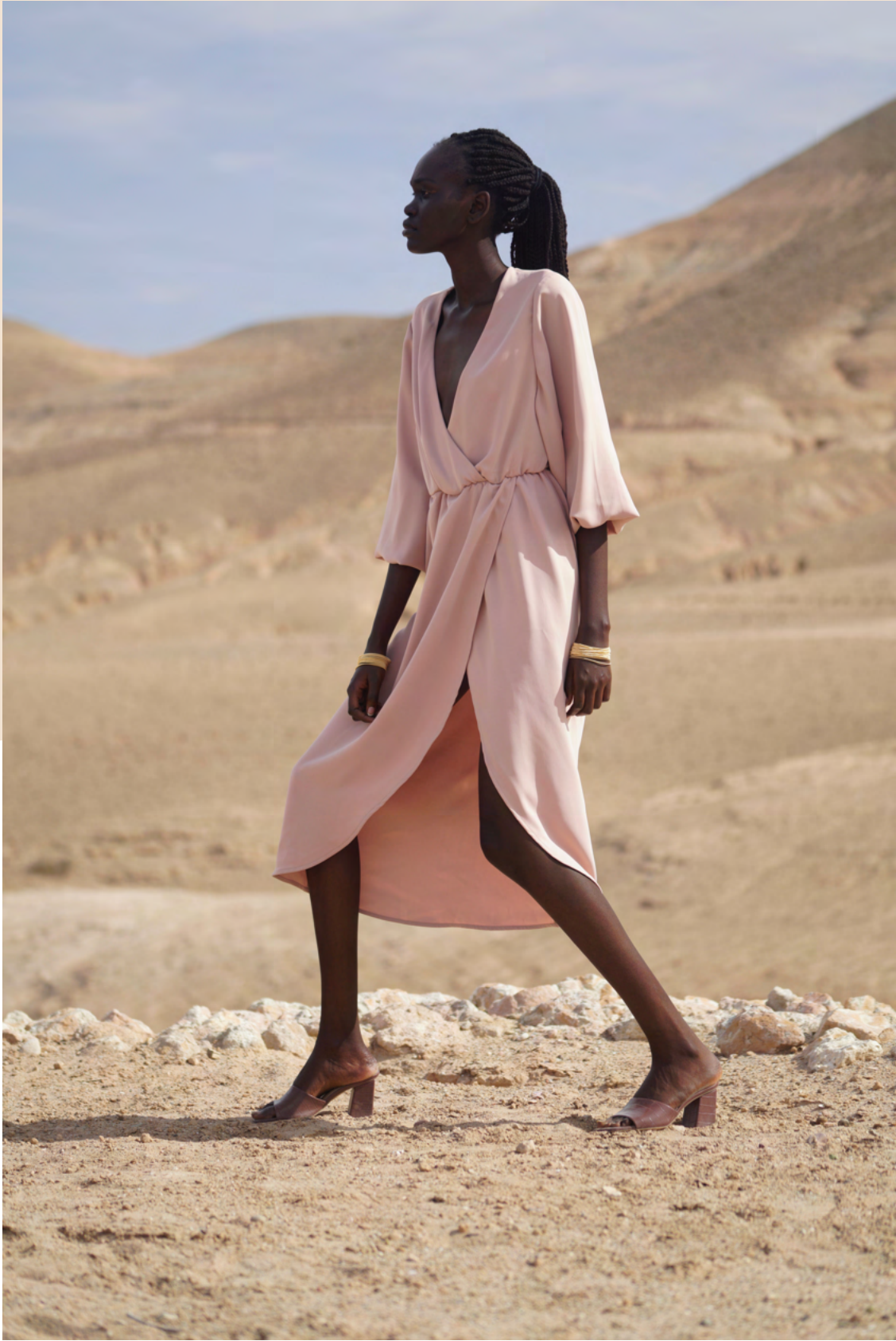
SYBEL Silk Dress