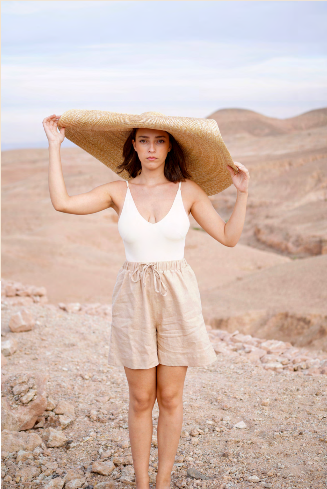
FAUDA Linen Shorts