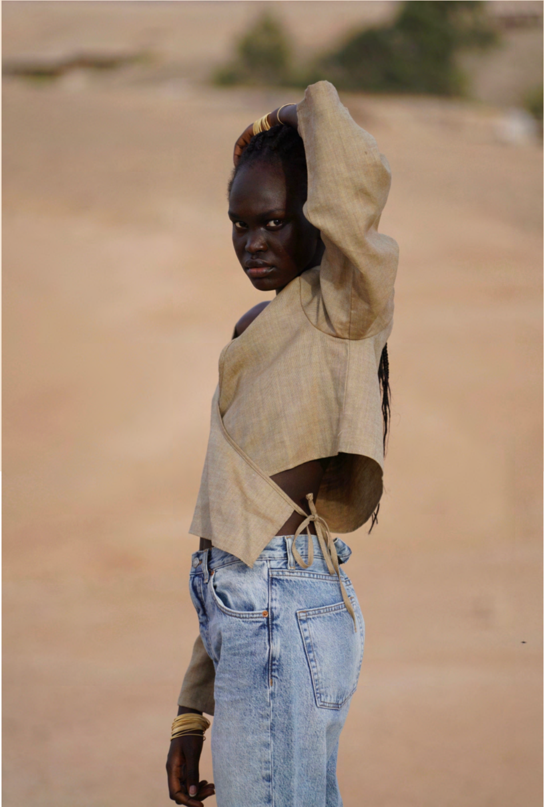
SAHARA Linen Top