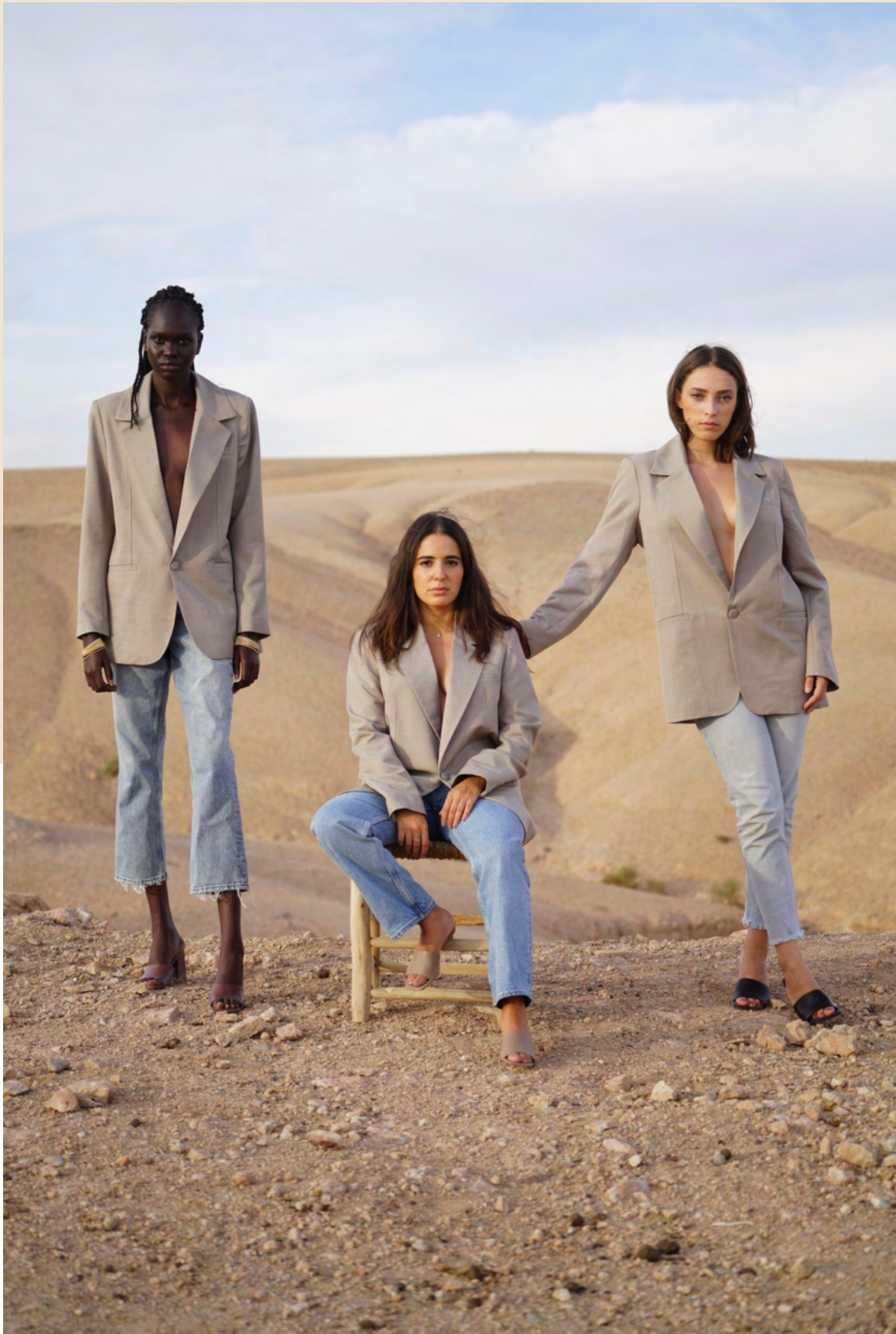
AZALÉE Oversized Wool Blazer