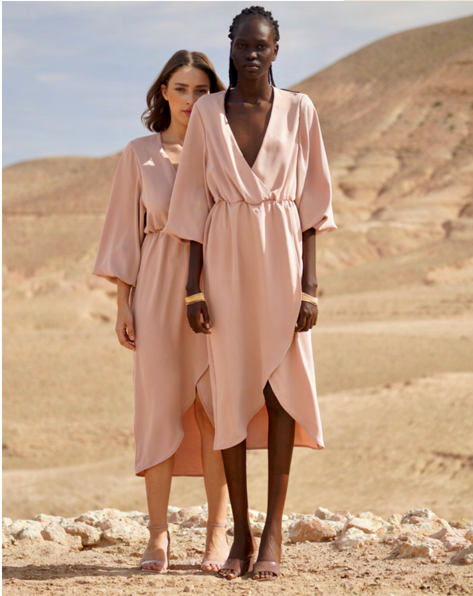
SYBEL Silk Dress