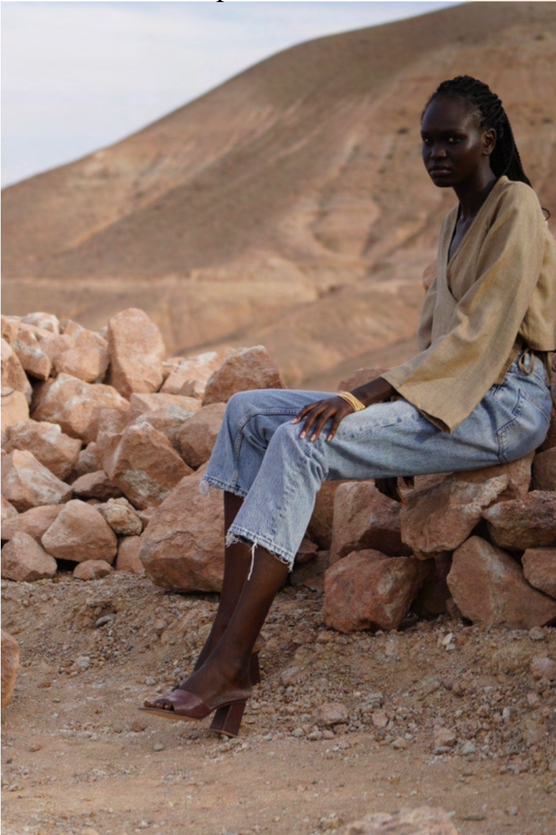
SAHARA Linen Top