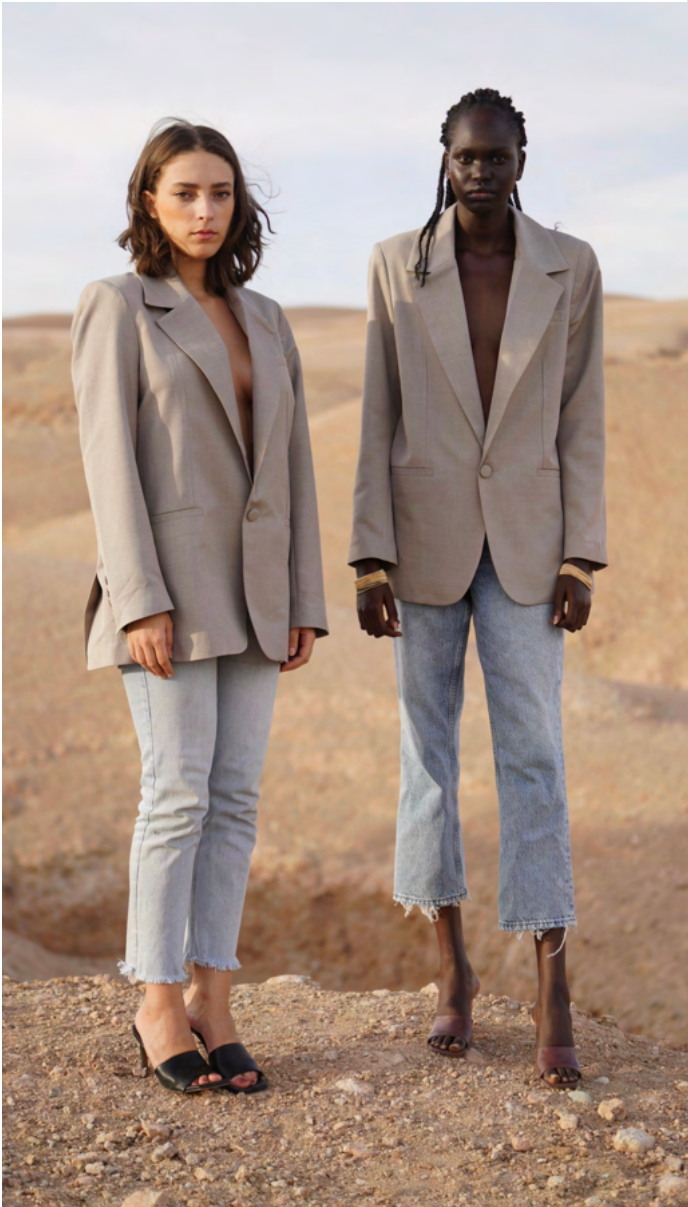
AZALÉE Oversized Wool Blazer