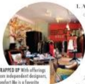
WRAPPED UP With offerings from independent designers, Comfort Me is a favorite boutique for all things cozy.

From a Chicago staple to neighborhood spots, this list of favorite boutiques is as chic and eclectic as our readers.