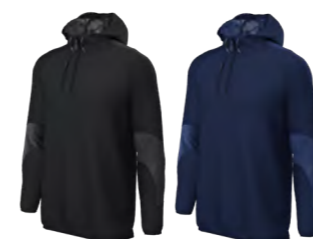
Black / Navy