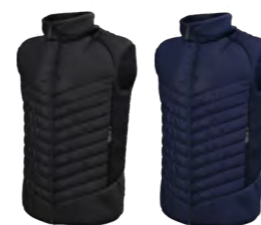
Black / Navy