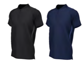
Black / Navy