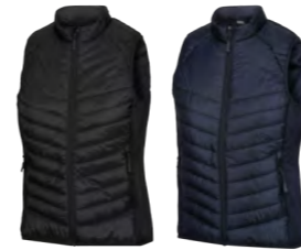
Black / Navy