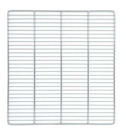
G. 24" Specialty (750 ml) Wine Rack Insert H. Tempered Glass Shelf Insert