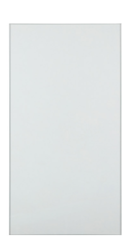
D. 15" Tempered Glass Shelf Insert