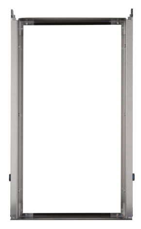
A. 15" Full-Extension Shelf Frame