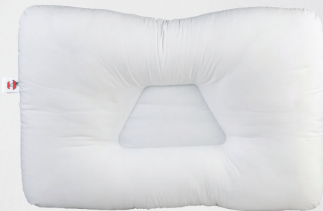
TRI-CORE® NATURAL CERVICAL PILLOW Trapezoid Center Head Cradle