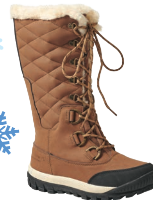
Isabella Boot $125; bearpaw.com