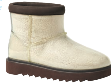
Koola Clear Mini Boot $110; koolaburra.com