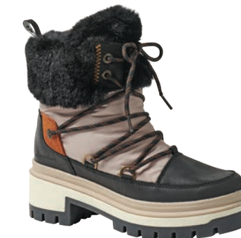
Marlow Boot $230; cougarshoes.com