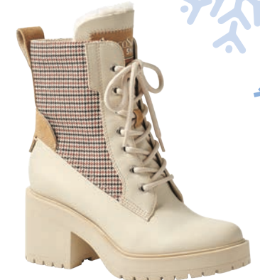
Dizzy Boot $185; francosarto.com