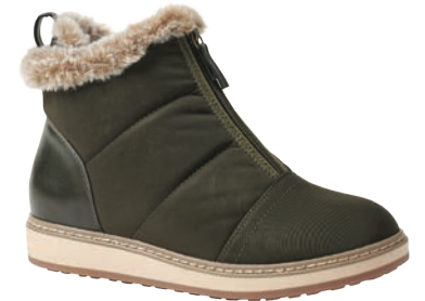
Tamarin Boot $89; whitemountainshoes.com