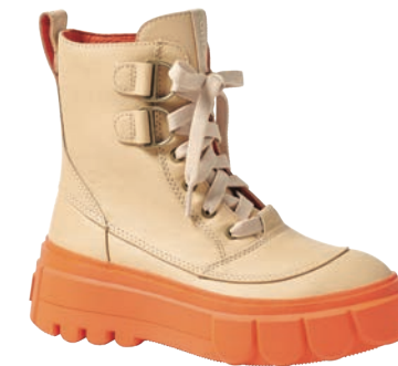
Caribou Boot $200; soarel.com