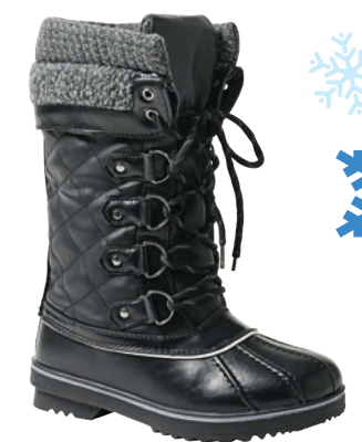
Lace Up Boot $66; dreampairshoes.com