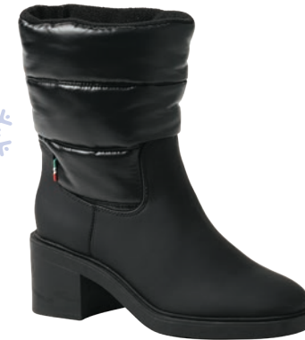
Snow Boot $185; francosarto.com