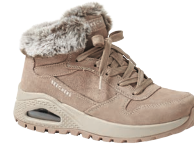
Uno Rugged Wintriness Boot $99; skechers.com