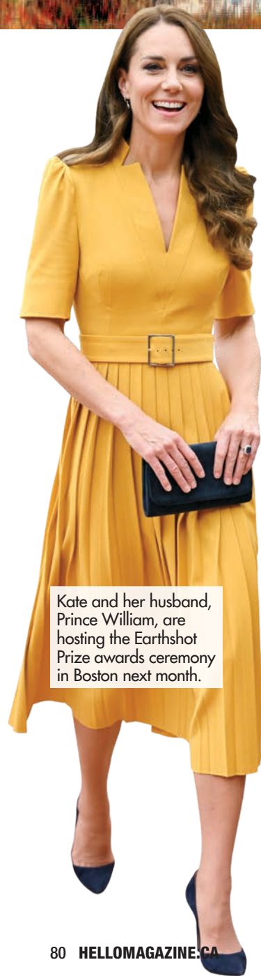
Kate and her husband, Prince William, are hosting the Earthshot Prize awards ceremony in Boston next month.