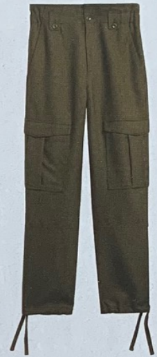
Lido Wool CARGO PANTS in New Heritage Olive Green, $175, bananarepublic.ca .

Feeling inspired? There are plenty of stylish cargo pants on the market.