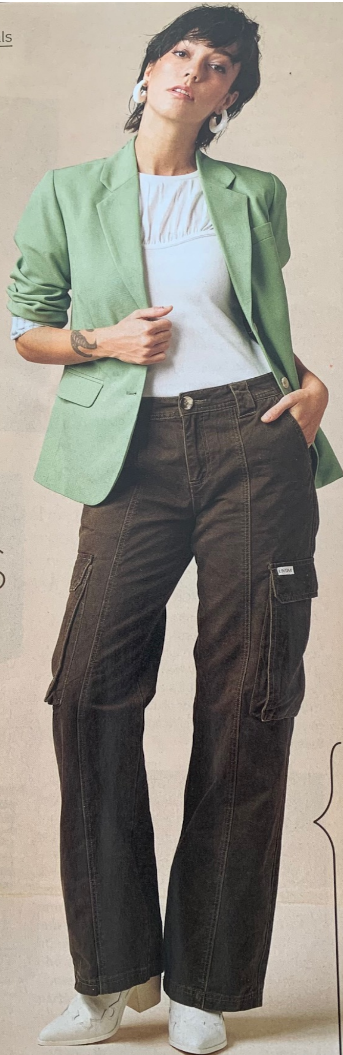
Utility Cotton Twill CARGO PANTS in Olive, $90, livom.ca.