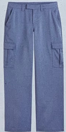
Straight CARGO PANTS in Pigeon Blue, $35, hm.com/ca .