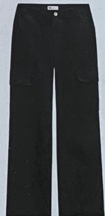
TRF Straight CARGO PANTS in Black, $50, zara.com .