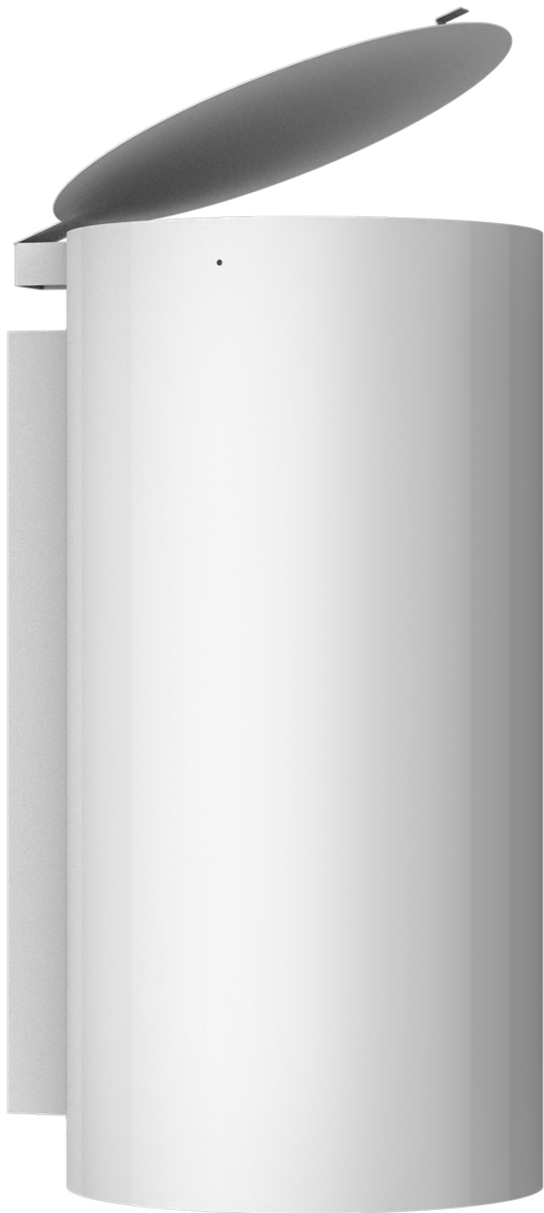
LIDDED TRASH CAN