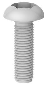
SCREWS M8 (6pcs)