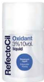
057816 Oxidant 3% liquid 100 ml

The intensive developer ensures brilliant colour results and can be used without concern in the sensitive eye-area.