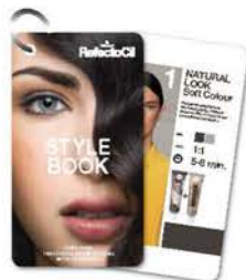
29071 Style Book

Shows every RefectoCil tint (including Blonde Brow) and helps with individual colour matches.