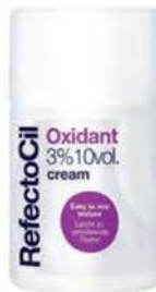
057817 Oxidant 3% cream 100 ml

The intensive developer ensures brilliant colour results and can be used without concern in the sensitive eye-area.