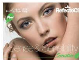
29070 Sensitive Colour Chart

The Style Book shows current catwalk trends and how to recreate them. It's the perfect tool for professionals and ideal for consulting customers. Only available in English but thanks to many explanatory pictures internationally useable.