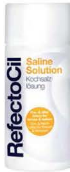
05890 Saline Solution 150 ml

Strengthens lashes and attracts eye make-up thanks to micellar technology „magnetically“. It cleans thoroughly – no rubbing! For an ideal tinting result and long-lasting duration use RefectoCil Micellar Eye Make-up Remover before styling the eye-area. Oil-free formula.