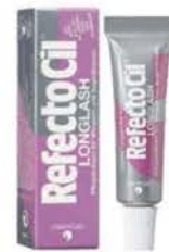
05784 Longlash Balsam 5 ml

RefectoCil Longlash Gel provides long-lasting moisture and healthy hair, that is less brittle. It can be used throughout the day to freshen up the look.