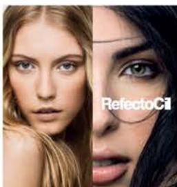
29063 Colour Chart

Shows every RefectoCil tint (including Blonde Brow) and helps with individual colour matches.