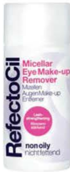
05889 Micellar Eye Make-up Remover 150 ml

Strengthens lashes and attracts eye make-up thanks to micellar technology „magnetically“. It cleans thoroughly – no rubbing! For an ideal tinting result and long-lasting duration use RefectoCil Micellar Eye Make-up Remover before styling the eye-area. Oil-free formula.