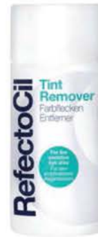
05888 Tint Remover 150 ml

For best possible results clean the eye-area thoroughly before or after applying Eyelash Curl or RefectoCil tints with RefectoCil Saline Solution. Degreases and removes residues.