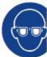
Tightly sealed goggles