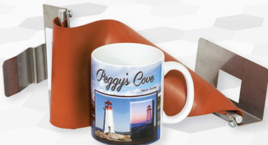
4" Straight Mug Wrap (shown with 11oz mug)