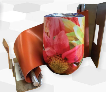
Custom Mug Wrap (shown with curved wine mug)