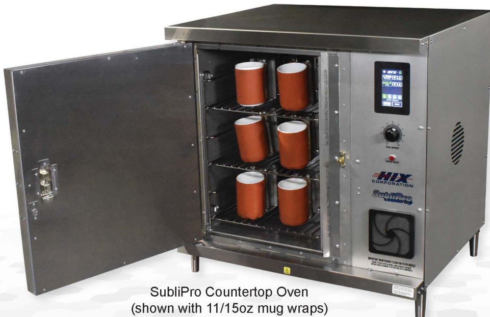
SubliPro Countertop Oven (shown with 11/15oz mug wraps)