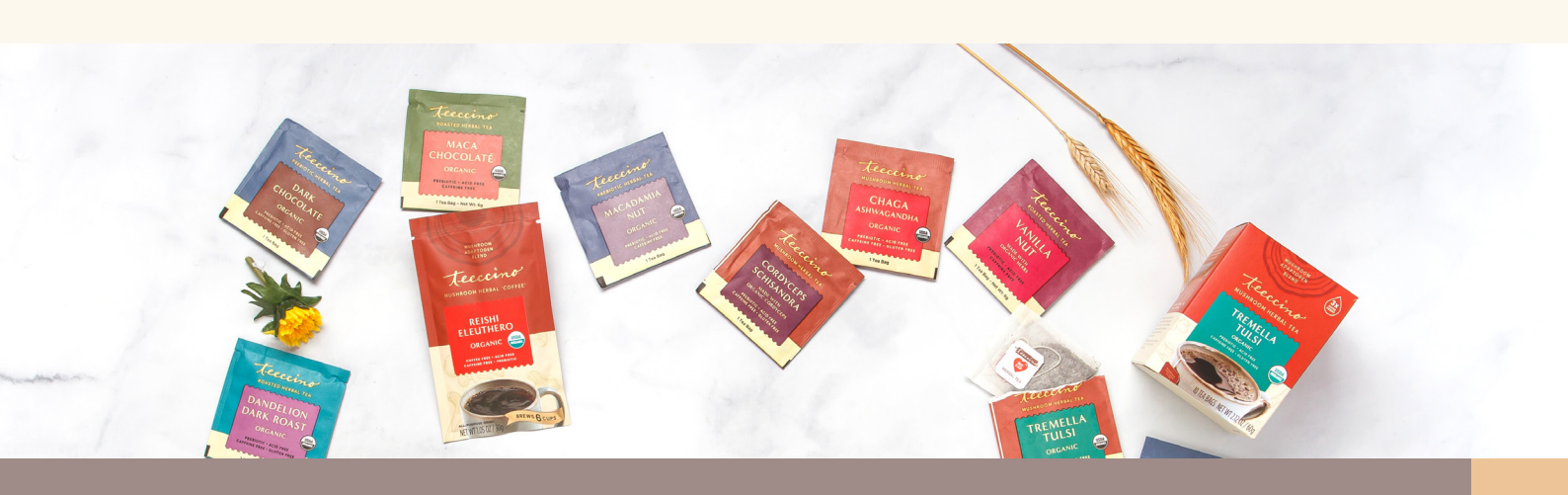
Day 14 - No Regular Coffee, 5 tbsp Teeccino