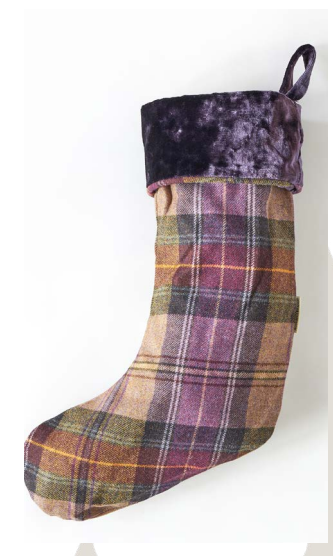
Luxury Christmas Stocking Purple £50.00