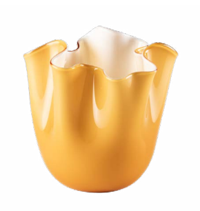
13.5cm Fazzoletto Vase Ambra £445.00