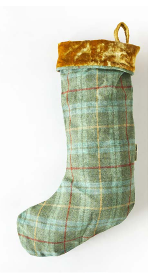
Luxury Christmas Stocking Green £50.00