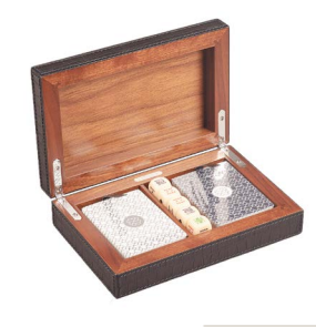
Ebury Bridge Set Moc Ebury Bridge Set Moc Montrose Scroll Bridge Croc Black £355.00