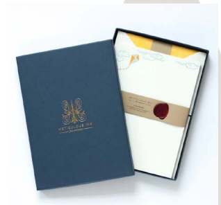
Kite Letterhead Set £30.00