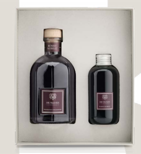
Rosso Nobile 250ml Diffuser and Refill Gift Set £71.40