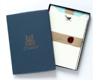
Blackbird Letterhead Set £30.00