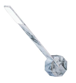
Octagon One Desk Light White Marble £75.00