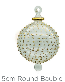
£9.50 *available in a variety of colours and styles