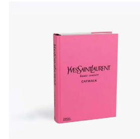
Yves Saint Laurent Catwalk £60.00