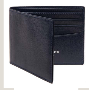
Capra Billfold Wallet Marine Blue £195.00