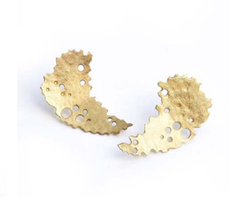
Coral Earrings Gold £75.00