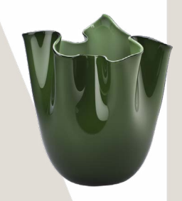
31cm Fazzoletto Vase 31cm Fazzoletto Vase Apple Green £950.00