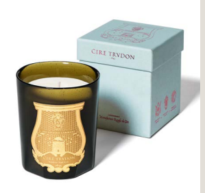
Dada Scented Candle Spiritus Scancti 270a £85.00