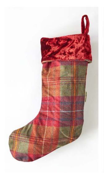
Luxury Christmas Stocking Red £50.00