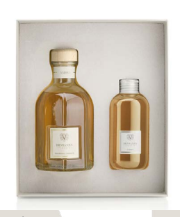
Ambra 250ml Diffuser and Refill Gift Set £61.40