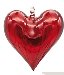
Heart Christmas Decoration £10.00