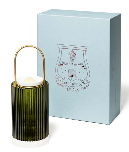
La Promeneuse Wax Melt Diffuser £310.00