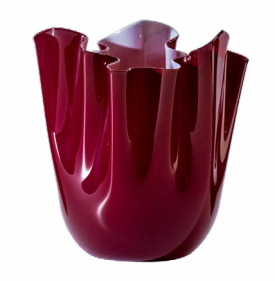
Blood Red £720.00