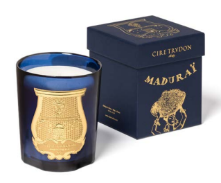
Madurai Scented Candle 270g £90.00