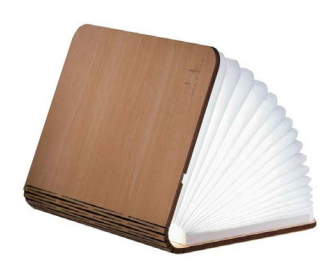
Maple Book Light Mini £35.00 Large £65.00