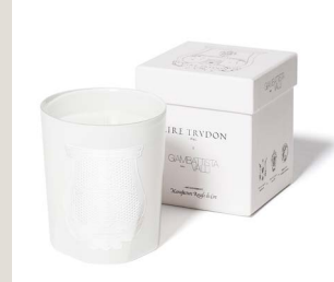
Positano Scented Candle 270g £90.00