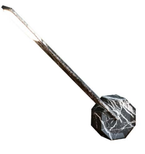
Octagon One Desk Light Black Marble £75.00