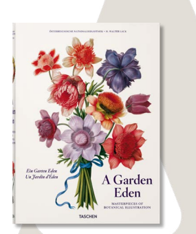
A Garden Eden £16.00