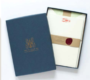
Lobster Letterhead Set £30.00