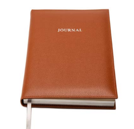
Capra Journal Tan £170.00