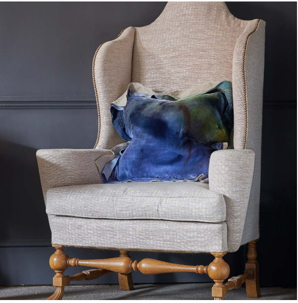
Square Silk Velvet Cushion £235.00 * available in a variety of colours