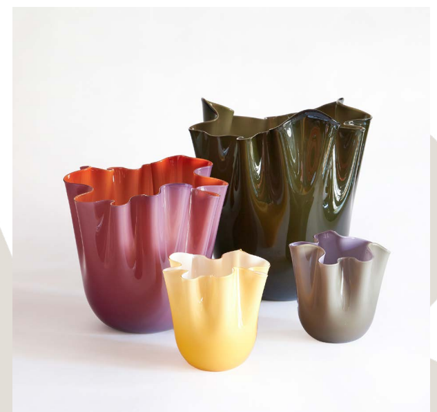
Fazzoletto Vase from £445.00

* available in a variety of colours and sizes