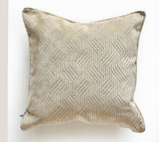
Augustus Brandt Textured Cushion £90.00