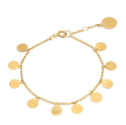
Carina Bracelet Gold £105.00