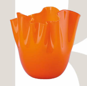
31cm Fazzoletto Vase Orange £950.00