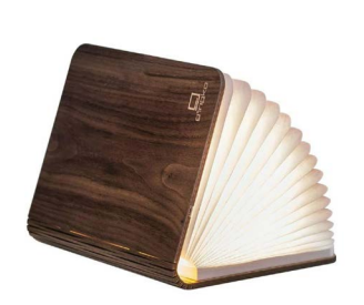
Walnut Book Light Mini £35.00 Large £65.00