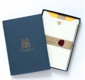
Honey Bee Letterhead Set £30.00