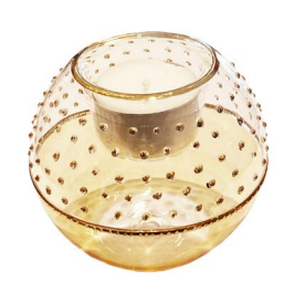
Tea Light Holder £16.00 *available in a variety of colours and styles