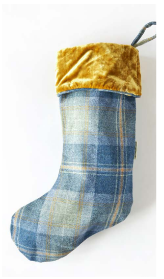
Luxury Christmas Stocking Blue £50.00