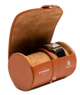
Capra Double Watch Roll Tan £300.00