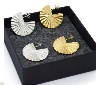
Fanella Earrings Silver | Gold £65.00