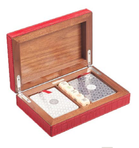
Croc Red £355