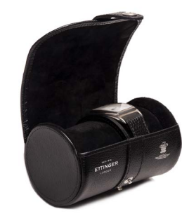
Capra Double Watch Roll Black £300.00