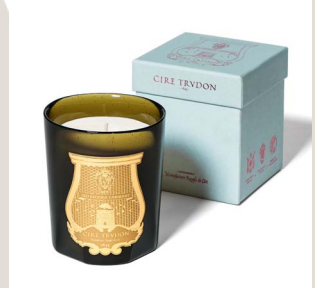
Scented Candle 270a £85.00