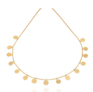
Carina Necklace Gold £145.00