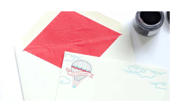
Hot Air Balloon Correspondence Letterhead Set £30.00