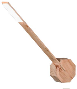
Octagon One Desk Light Maple £75.00