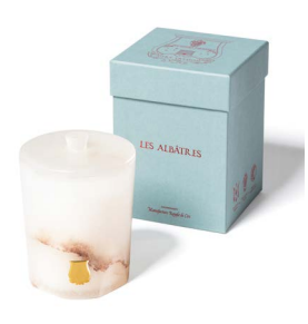
The Alabaster Ernesto Scented Candle £170.00

The Company supplied the court of Louis XIV, as well as almost all the large and prominent churches in Paris and the surrounding region.