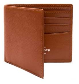
Capra Billfold Wallet Tan £195.00