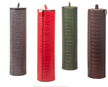
Moc Croc Large Leather Match Holder £225.00