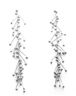
Aria Earrings Silver £110.00