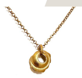
Shell Pendant Necklace Gold £95.00