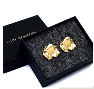
Fall Earrings Gold £40.00