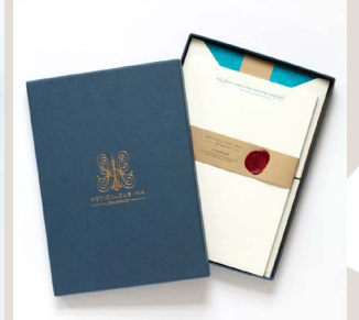
'The Pen is Mightier' Letterhead Set £30.00