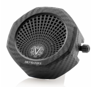
Carparfum gift box £49.00 Available in: Rosso & Ambra, Rosso & Oud or Rosso & Peonia Black Jasmine