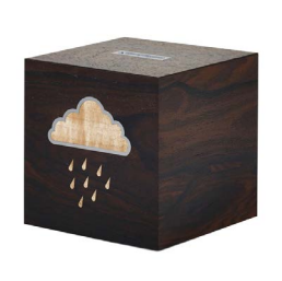
Rainy Days Money Box £375.00