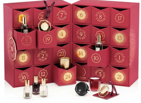
Dr Vranjes Advent Calendar £400.00

With 24 windows and drawers hold scented surprises and lovely decorative accessories, to treat yourself and your loved ones every day.