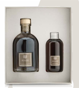
Oud Nobile 250ml Diffuser and Refill Gift Set £71.40

With 24 windows and drawers hold scented surprises and lovely decorative accessories, to treat yourself and your loved ones every day.