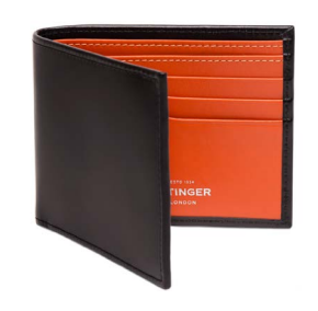
Sterling Billfold Wallet Black/Orange £195.00