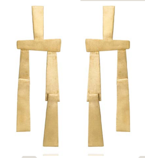
Tor Earrings Gold £105.00