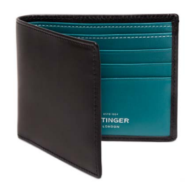
Sterling Billfold Wallet Black/Turquoise £195.00