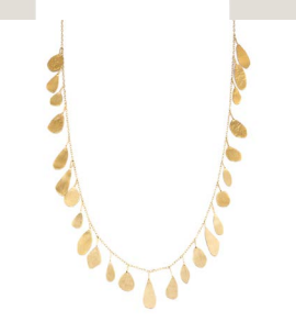
Drape Necklace Gold £205.00