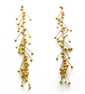
Aria Earrings Gold £125.00