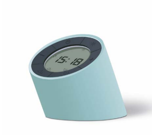
Edge Light Alarm Clock Green £39.95