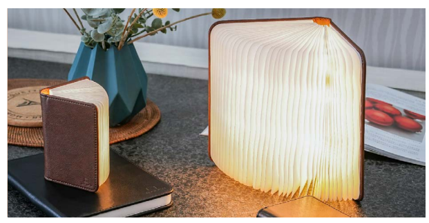
Smart Book Light From £35.00 *available in a variety of colours and sizes