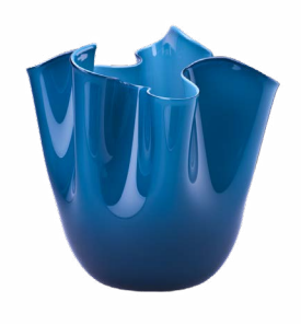
13.5cm Fazzoletto Vase Horizon £445.00