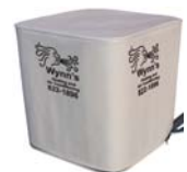
Custom Printed Covers