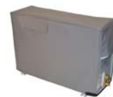
Ductless Split Covers