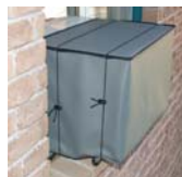
Window Unit Covers