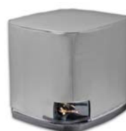
Condensing unit covers