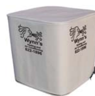
Custom printed covers