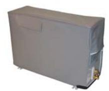
Ductless Split Covers

● Toll-free 1-888-454-662 ● Phone: 905-265-0172 ● Fax: 905-265-0175 ● www.brinmar.com ● sales@brinmar.com