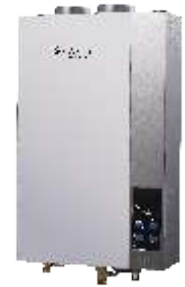
POWER GAS 16L ETL

Marey: 1924 HWY 95 North Bastrop, TX 78602 Tel: 1-512-332-2229 Toll Free: 1-855-627-3955 1-855-MAREY-55