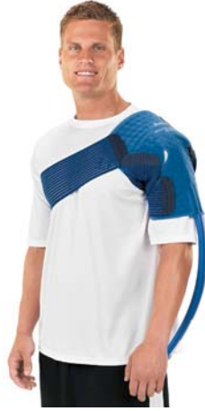
Intelli-Flo Shoulder Pad (13.5" x 14") X-Large (13" x 21")