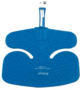
Intelli-Flo Multi-Use Pad (13.5" x 14.25")

These revolutionary pads offer temperature specific to each treatment area, allowing for consistent cold delivery. The ergonomic design provides exceptional coverage, static compression, and patient comfort. Intelli-Flo Pads are compatible with Polar Care Kodiak only. Proper use requires an insulation barrier between the Intelli-Flo Pads and the patient's skin. The water impermeable Sterile Polar Dressings offered by Breg provide an appropriate and complete barrier between the pad and the patient's skin.