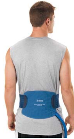
Intelli-Flo Back Pad (8.25" x 11.25")