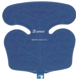
Multi-Use XL WrapOn Pad (11.25" x 11.25")

The WrapOn Polar Pads' ergonomic design provides exceptional coverage and patient comfort. Elastic straps offer static compression while holding the pad firmly in place. WrapOn Pads may be used with the Polar Care Glacier, Cube, and Cub only. Proper use requires an insulation barrier between the pad and the patient's skin. The water impermeable Sterile Polar Dressings offered by Breg provide a complete barrier between the pad and the patient's skin.