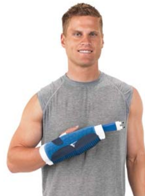
Hand / Wrist WrapOn Pad (8.5" x 9.75")