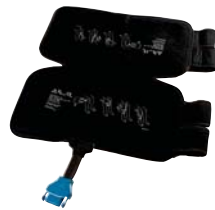
Large Knee Pad