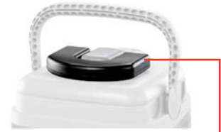
Polar Care Kodiak Battery Pack (optional)