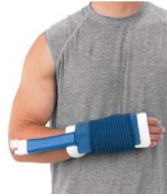
Shown on Hand Intelli-Flo 3x5 Pad (3" x 5")