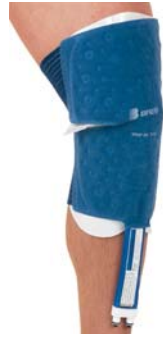
Knee WrapOn Pad (10.25" x 11.25") Large (11.5" x 12") XL (12.25" x 19")