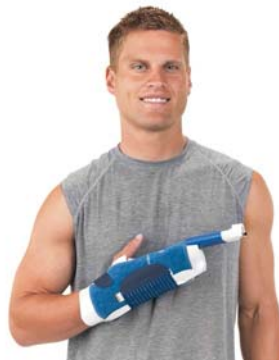
Intelli-Flo Hand / Wrist Pad (8.25" x 9.75")