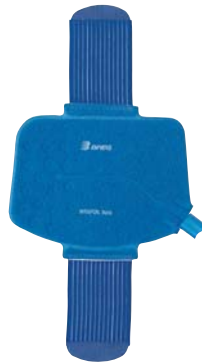
Back WrapOn Pad (8.25" x 11")