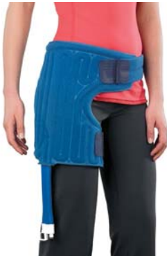
Intelli-Flo Hip Pad (13" x 20")