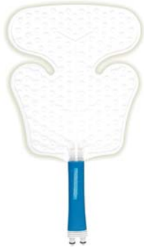
Multi-Use Polar Pad (9.75" x 11.25")

Polar Pads' ergonomic design provides exceptional coverage and patient comfort. Polar Pads may be used with the Polar Care Glacier, Cube, and Cub only. Proper use requires an insulation barrier between the pad and the patient's skin.