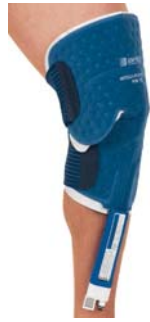
Intelli-Flo Knee Pad (13.5" x 14")