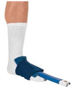
Shown on Foot Intelli-Flo 3x5 Pad (3" x 5")