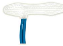
TMJ Polar Pad (4.25" x 16")