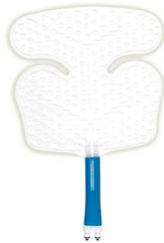
Multi-Use Polar Pad XL (11.5" x 11.75")