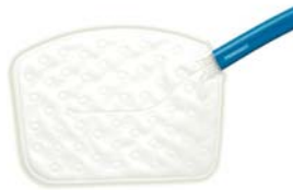
Back Polar Pad (6.25" x 11.25")