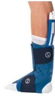
Intelli-Flo Ankle Pad (12.75" x 18.5") Small (8.25" x 9.75") Part number 10210 shown