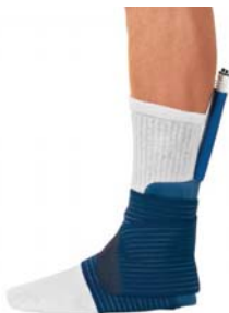
Ankle WrapOn Pad (8.25" x 9.75")