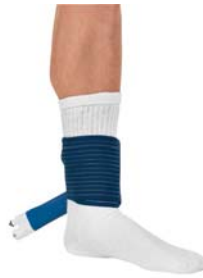
Shown on Ankle Intelli-Flo 3x5 Pad (3" x 5")