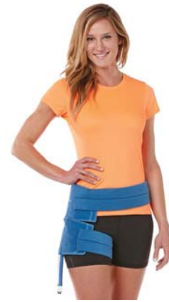
WrapOn Hip Pad (11.5" x 12") Long strap length = 44" Short strap length = 26"