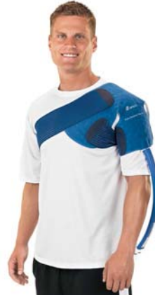
Shoulder WrapOn Pad (10.25" x 11.5") X-Large (13" x 21.5") (10" x 11.75")