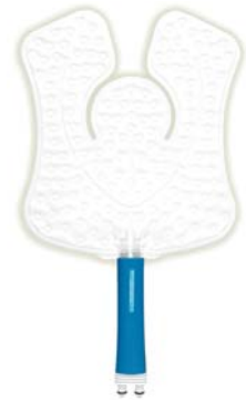
Knee / Shoulder Polar Pad (9.75" x 11.25")