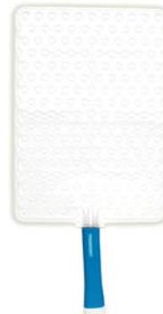
Rectangle Polar Pad Small (4.5" x 10.75") Large (10" x 14.25")