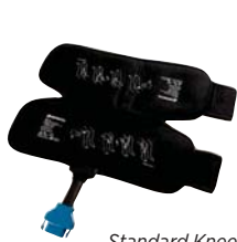
Standard Knee Pad