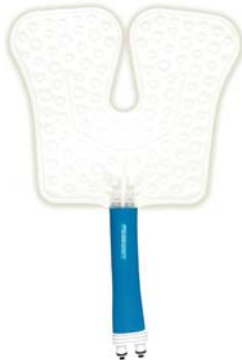
Ankle Polar Pad (8.25" x 9.75")