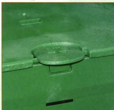
Wind fix, lid adjustment