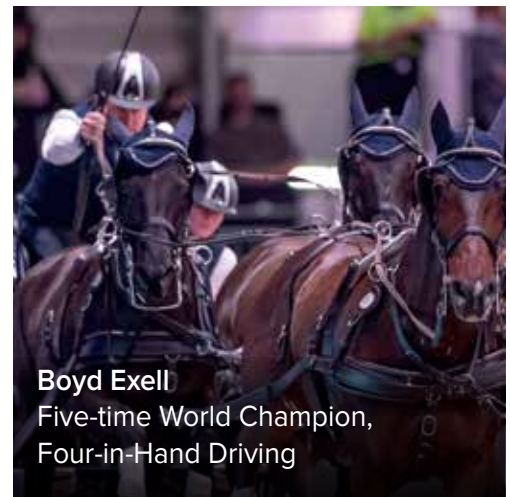
Boyd Exell Five-time World Champion, Four-in-Hand Driving