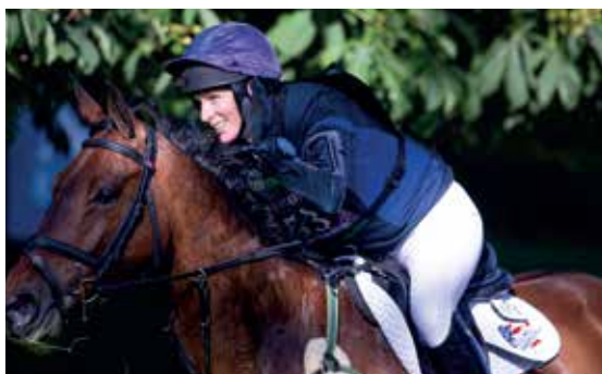
Zara Tindall MBE British Equestrian & Olympic Silver Medallist