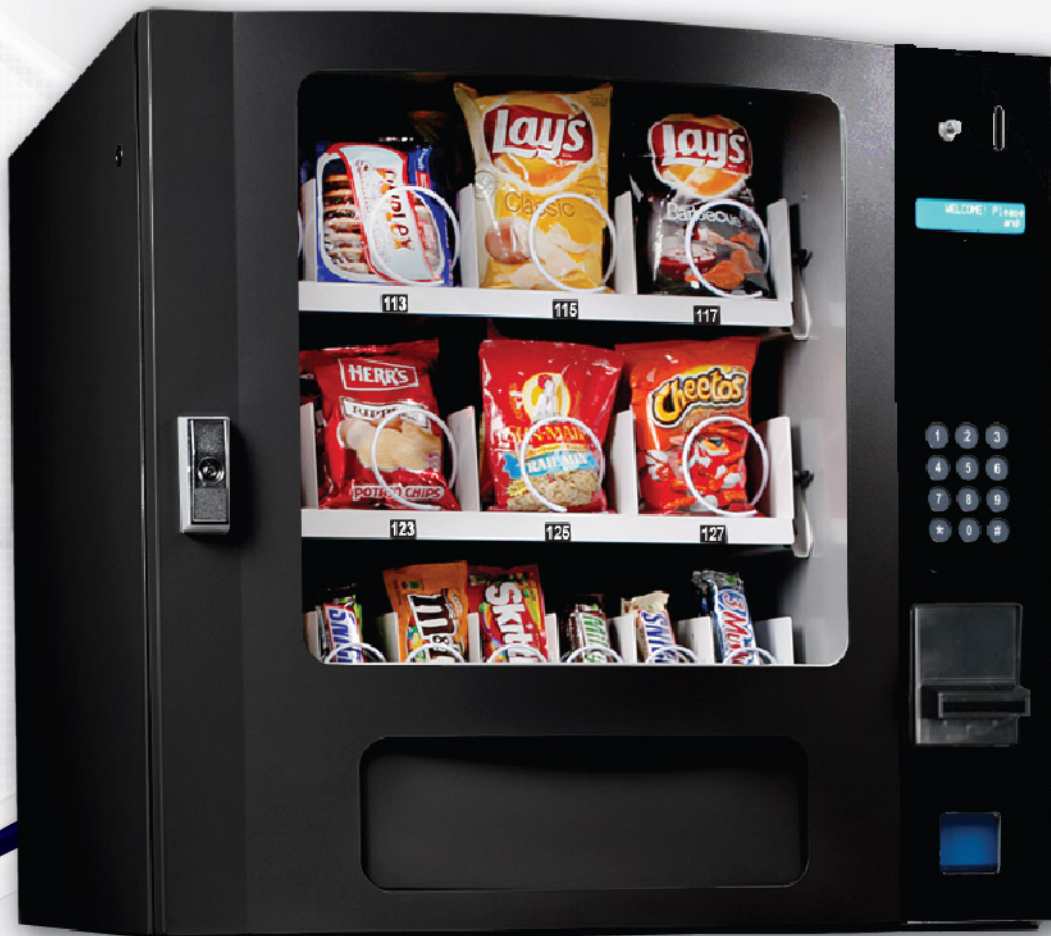
SM16 Countertop Snack Vendor