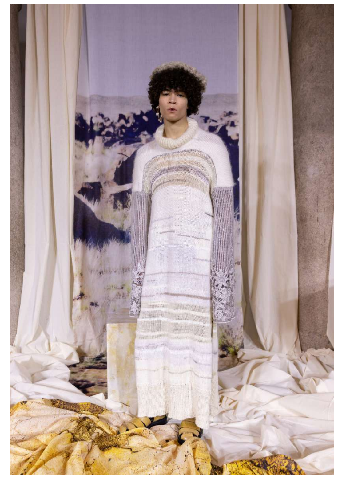
VIVKARR 25 'Kersefontein Stairs with Victorian Decor' Knitted Dress