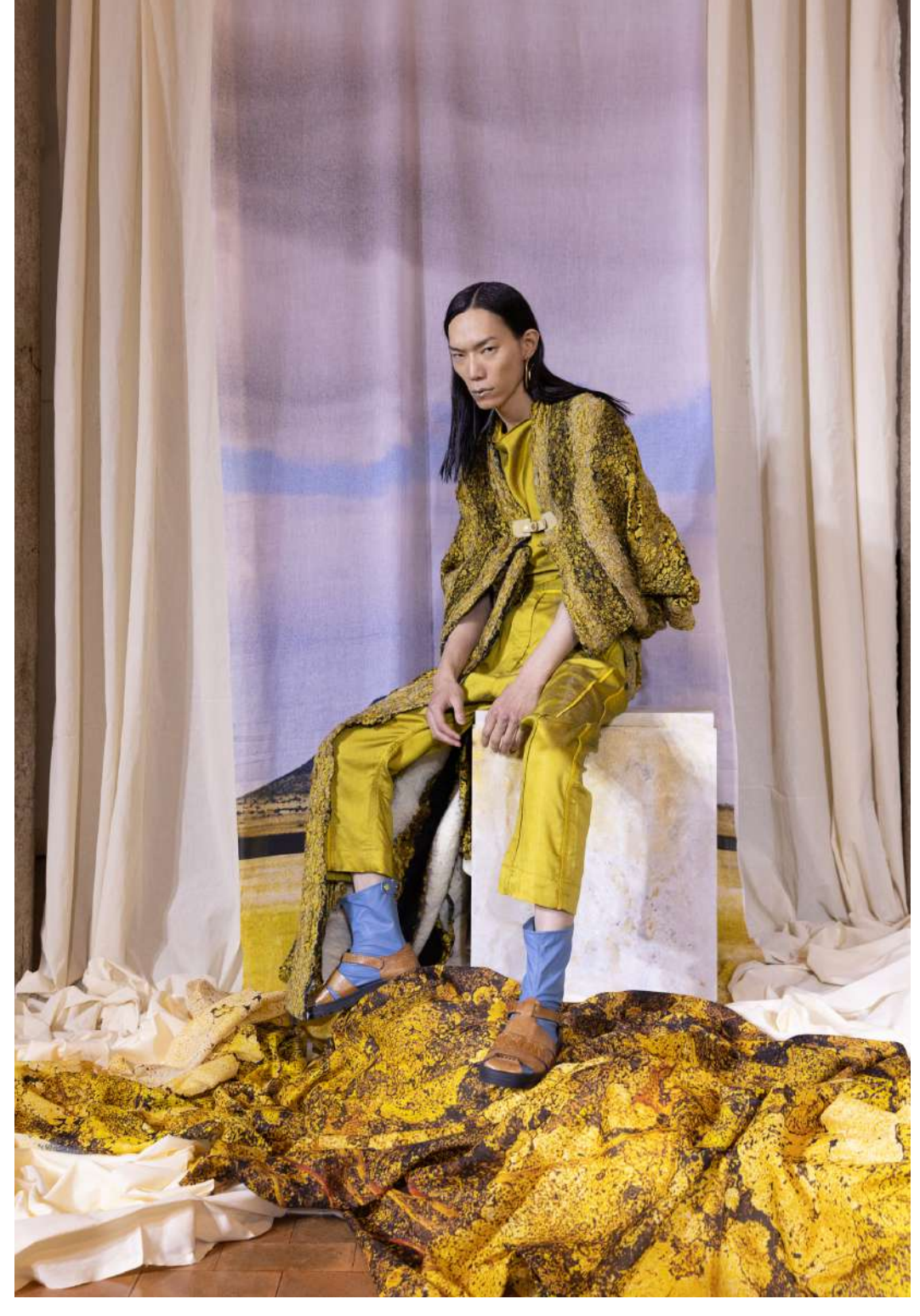
VIVKARR 14 'Golden Karoo' Felt-on-Lace Sculpted Top 'Golden Karoo' Arched Leg Tailored Pants Artisanal 'Golden Karoo' Felt-on-Lace Coat