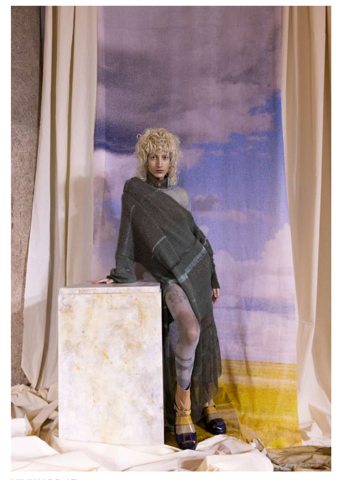
VIVIKARR 17 Green Asymmetrical Silk, Mohair & Wool Knitted Dress

Fossil Flower Lace & Nylon Zibbon Cocoon Coat