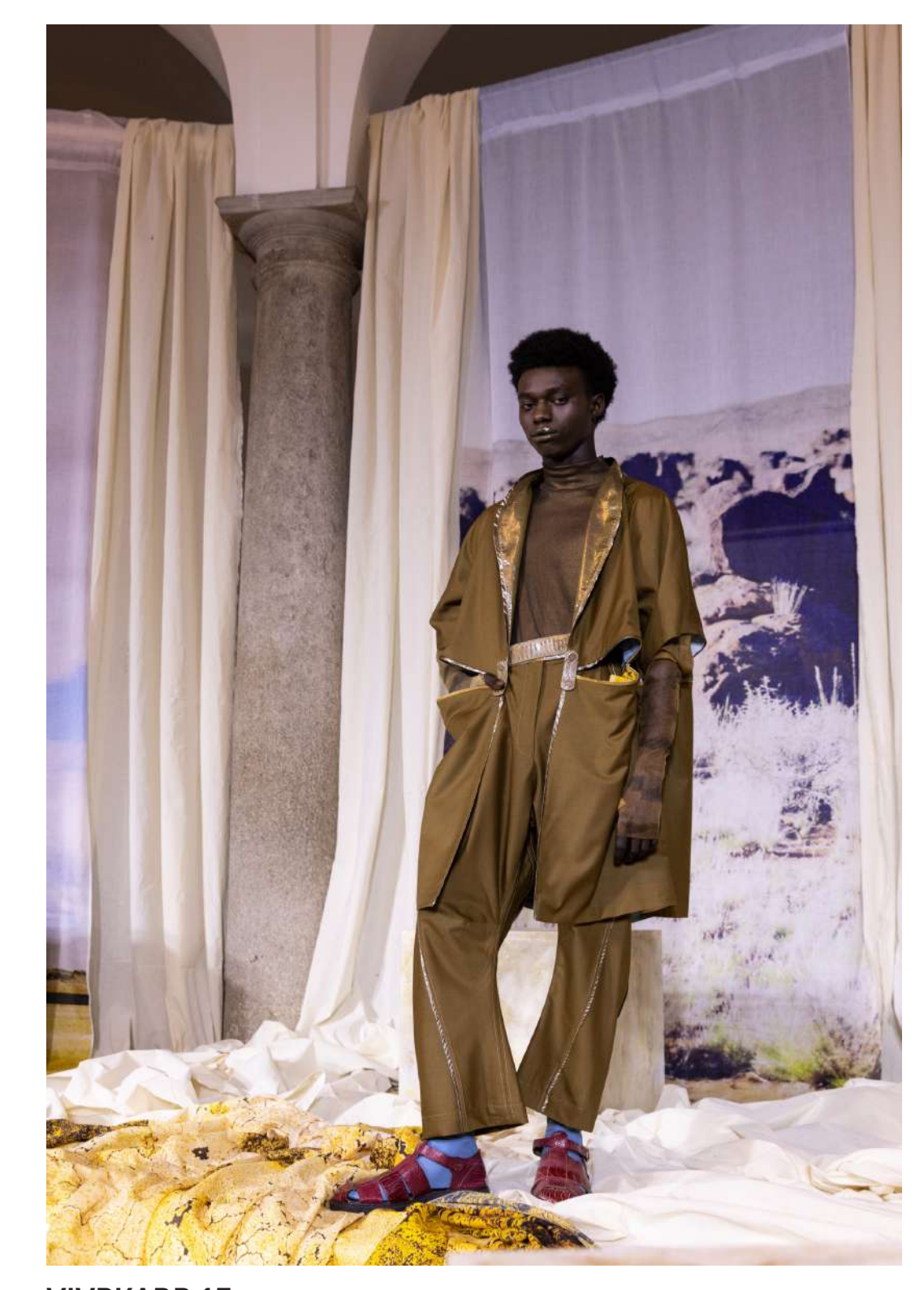
VIVPKARR 13 Wet Dust Silk Mohair Lamé Turtle Neck

Speckeled Wool Tailored Pants with Shin Detail