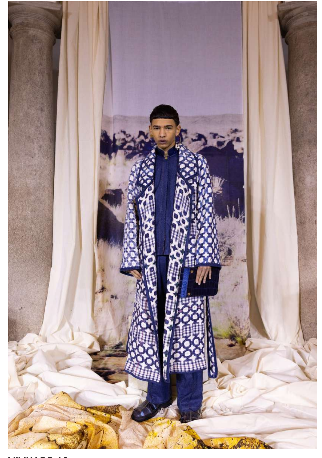
VIVKARR 12 Speckeled Wool Shirt with Shin Collar

Speckeled Wool Tailored Pants with Shin Detail