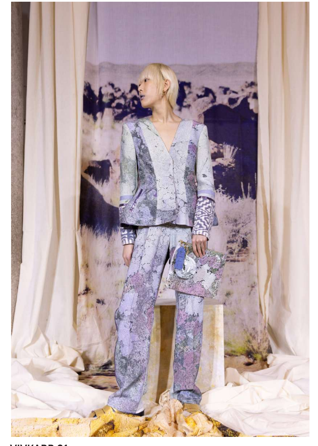
VIVKARR 21 Sandra's Sculpted Lychem Tailored Jacket in Vintage Rayon Lychem Tailored Trousers with Shin Detail in Vintage Rayon