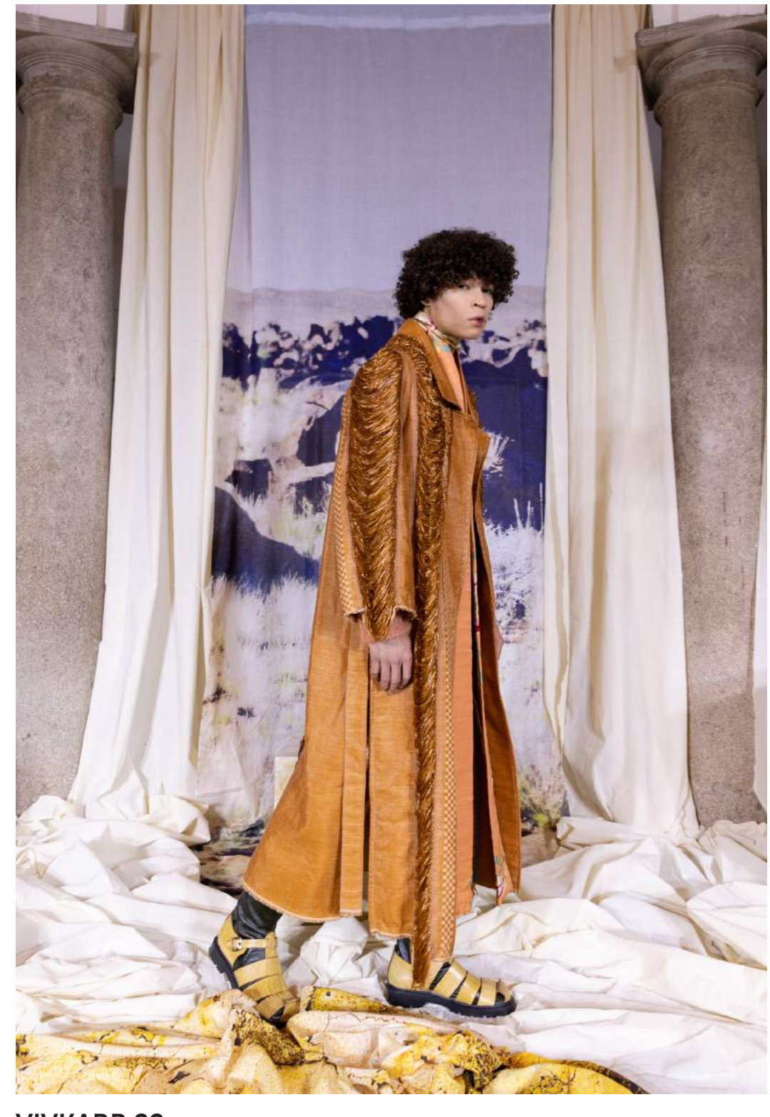
VIVKARR 22 Erosion Artisanal Raffia Raglan Coat