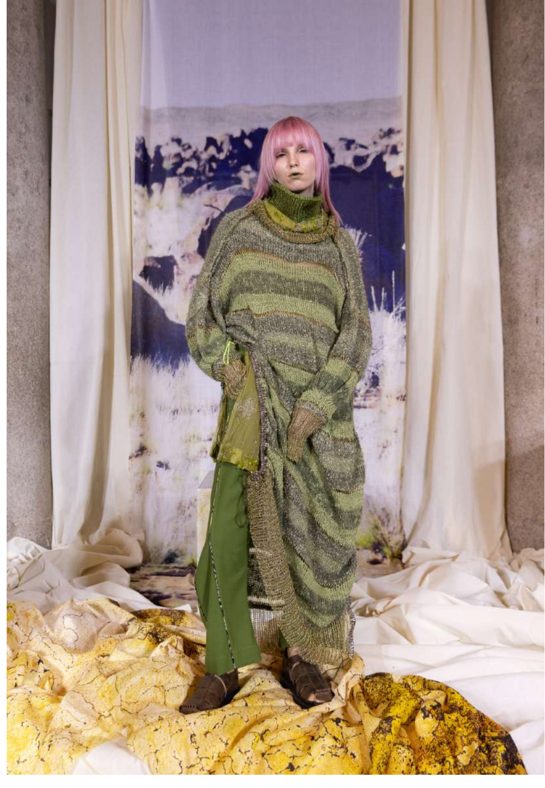
VIVKARR 18 Green Moss Knitted Draoed Dress with Drawstring in Mohair, Wool & Viscose Blend