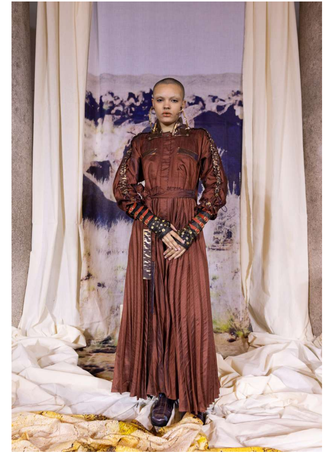
VIVKARR 19 Iron-Ore Accordion Pleated Maxi Dress in Deadstock Synthetic