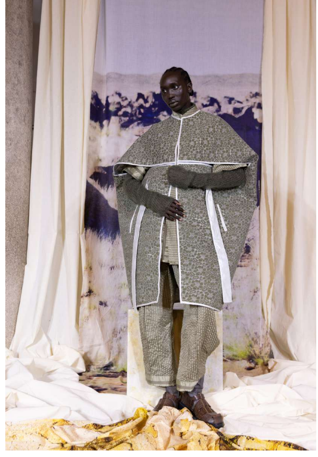
VIVKARR 16 Tortoise Shell Sage Green Deadstock Silk Blend Qipao Jacket

Tortoise Shell Sage Green Deadstock Silk Blend Pants