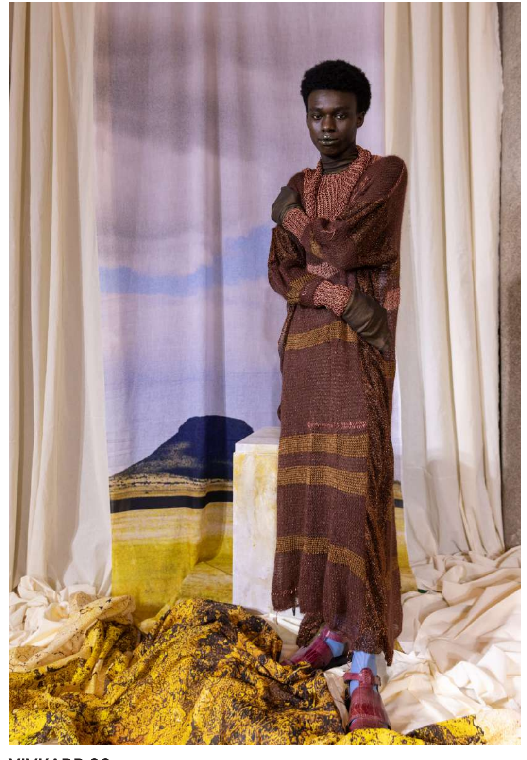
VIVKARR 20 Copper Wool, Kid-Mohair & Viscose Knitted Dress