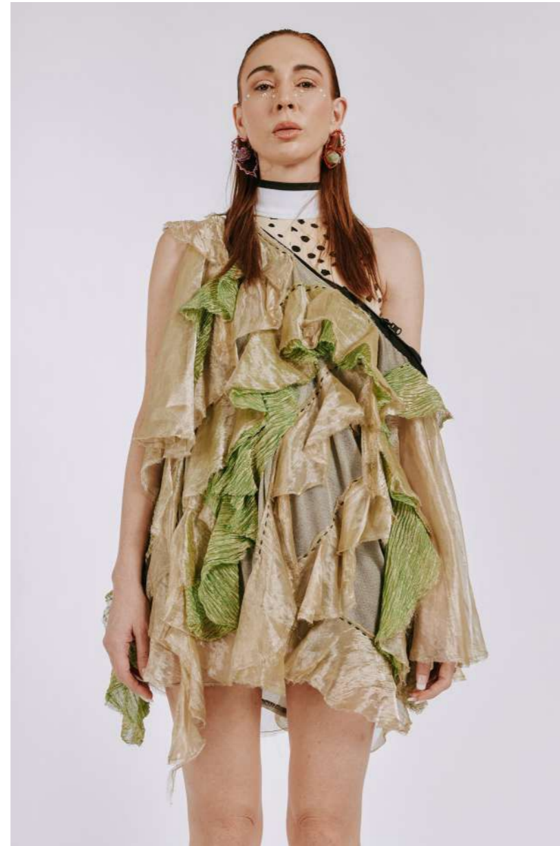
OFFCUT OF NEBULA LOOK LEOTARD - R6 900,00 DRESS - R15 500,00