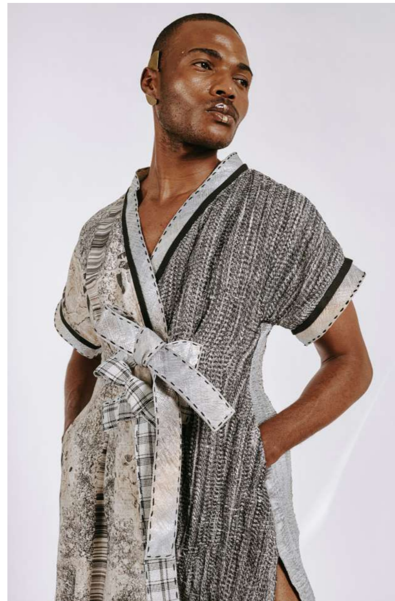
HAND EMBROIDERED SEDMENTARY ROCK LOOK DRESS - R27 900,00