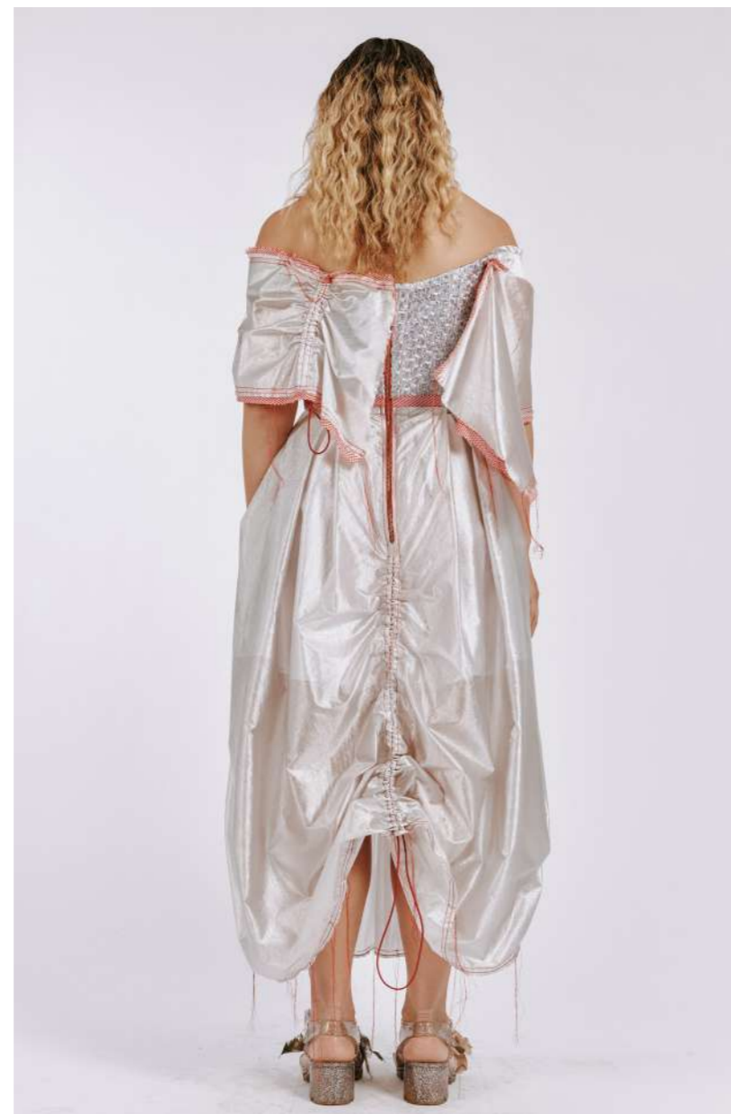
ETERNAL TRANSLUCENT LOOK DRESS - R38 000,00