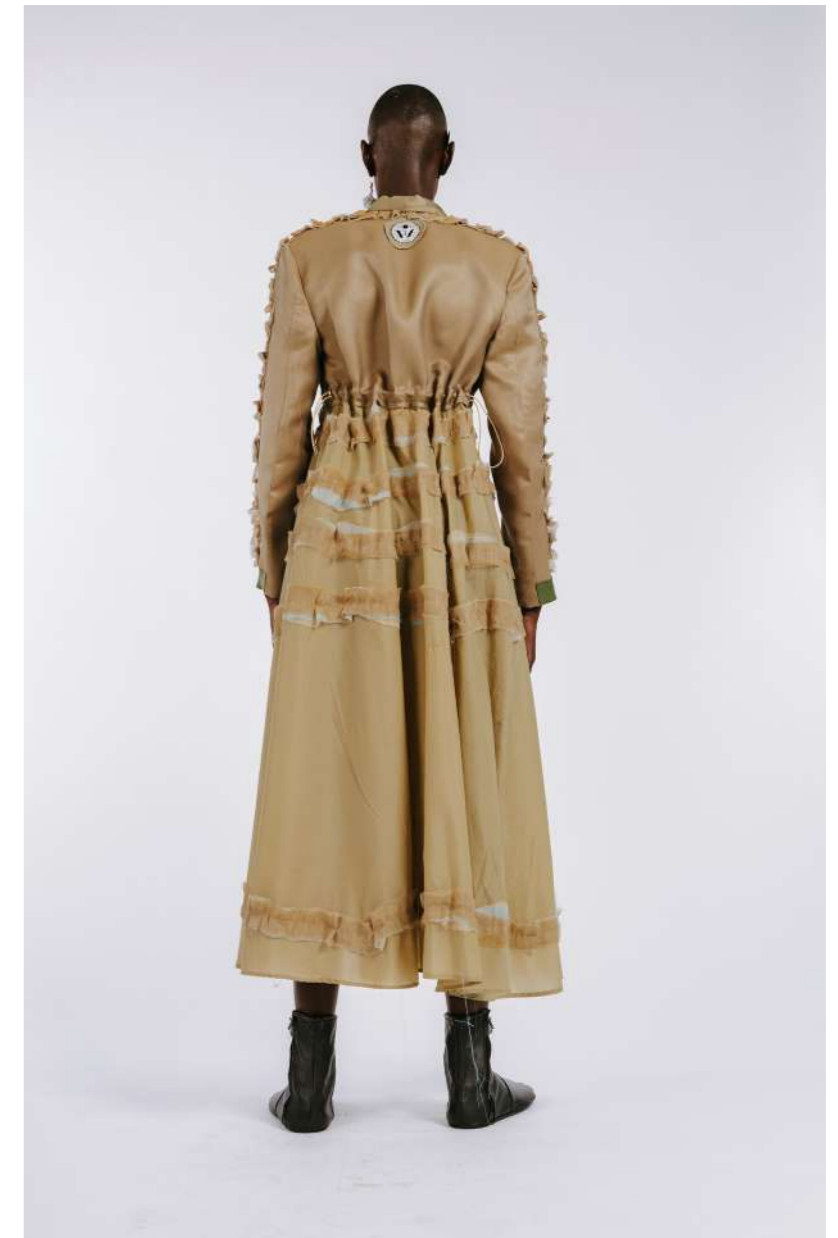
BARCHAN DUNE LOOK COAT - R49 400.00