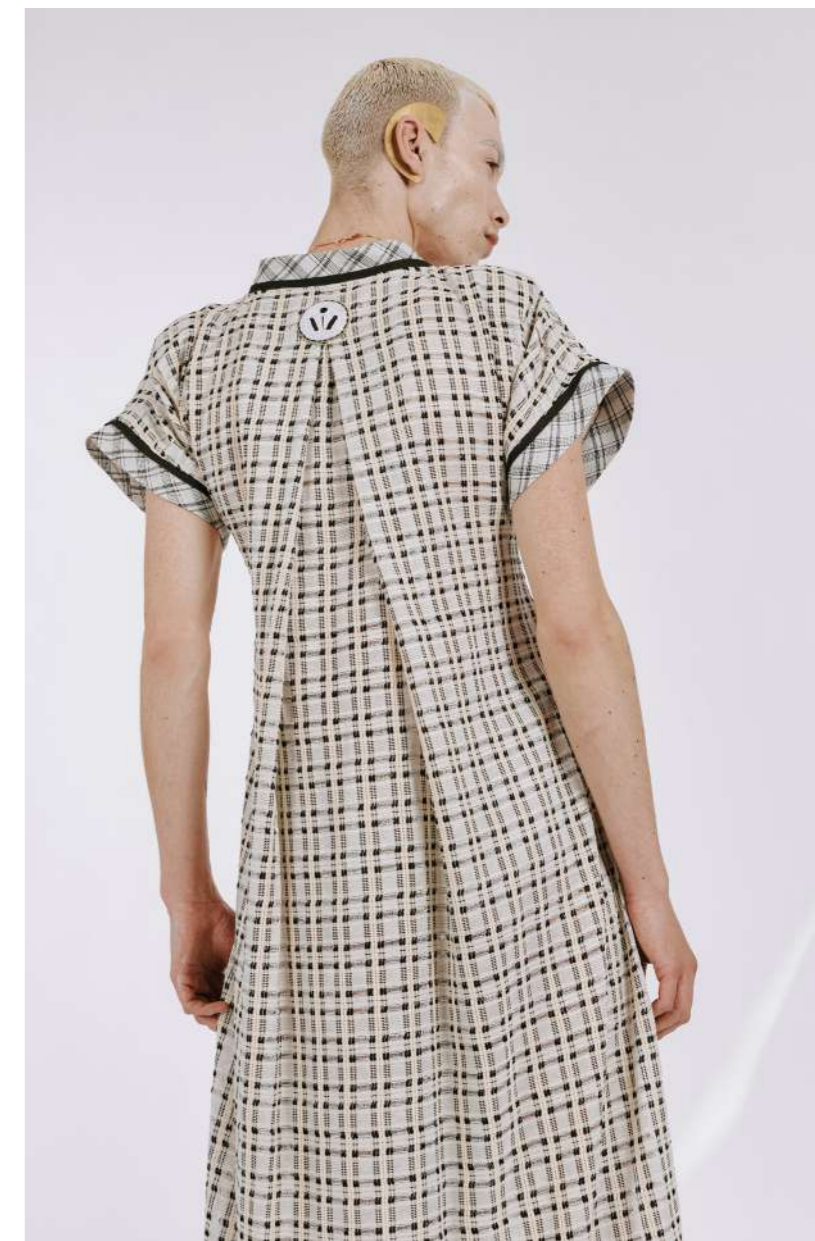
OBSIDIAN STONE LOOK DRESS - R24 100,00