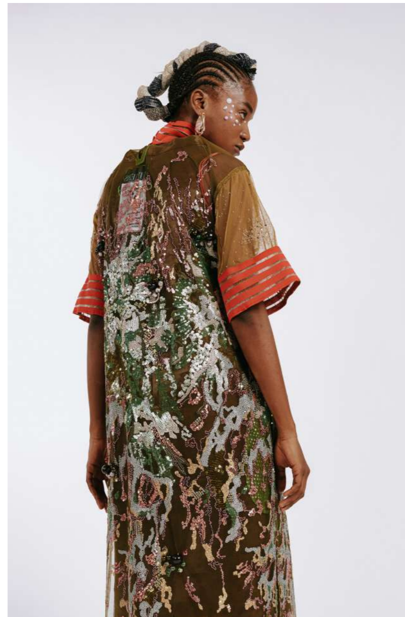
CRYSTAL ENCRUSTED LOOK DRESS - R 22 000,00