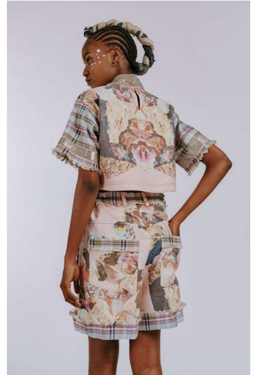
MEGALITHIC CRYSTAL COLLAGE LOOK TOP - R15 800,00 SHORTS - R20 400,00