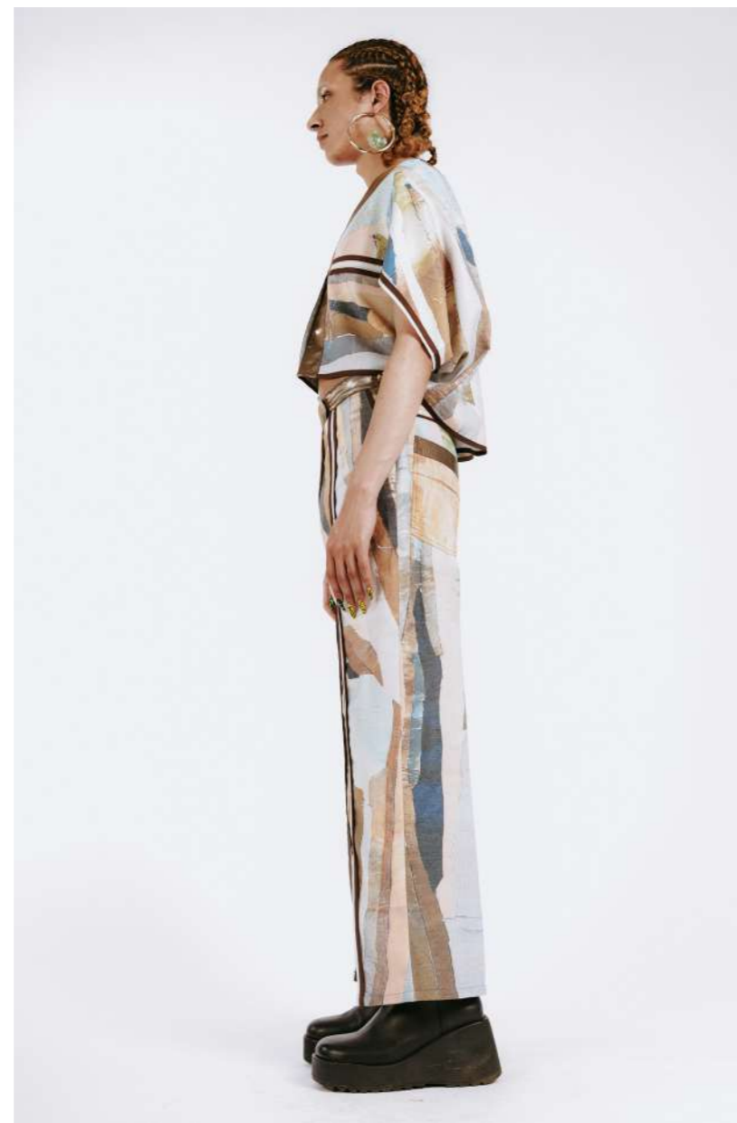
TECTONIC PLATES LOOK TOP - R12 100,00 TROUSERS - R19 600,00