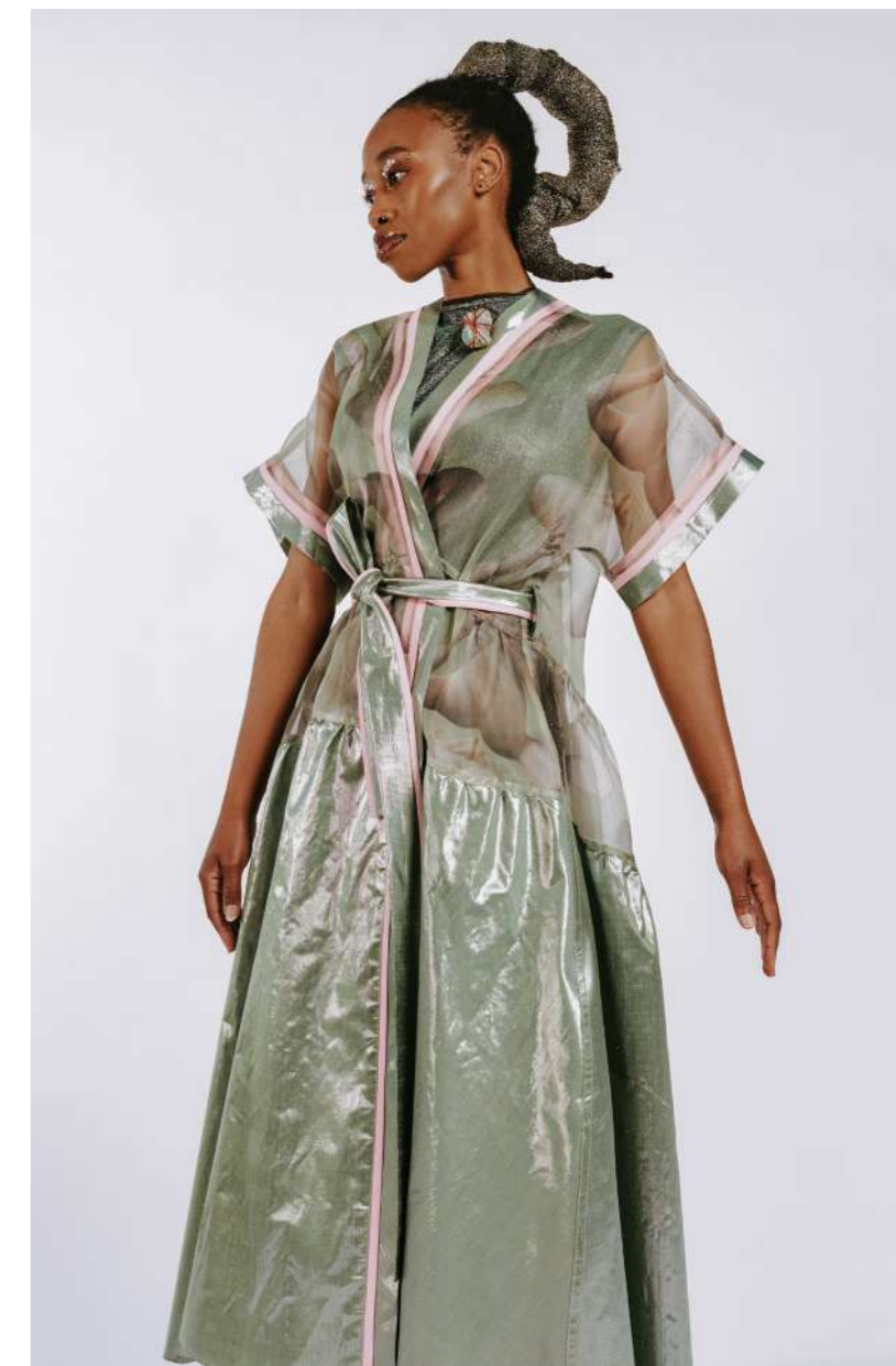
REFLECTION BUTT-O-BODY PRINTED LOOK SLIP DRESS - R9 500.00 WRAP DRESS - R39 900.00