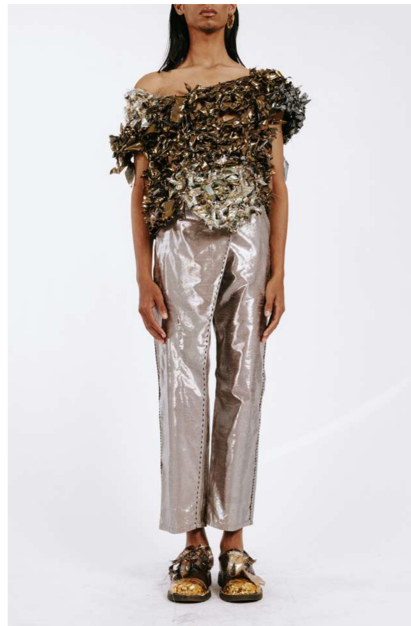
HAND CROCHET LIQUID LOOK