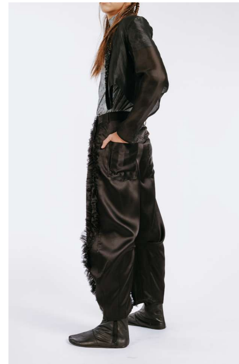
SILICA AND QUARTZ HAND EMBROIDERED LOOK TOP - R4 200,00 JACKET - R24 200,00 TROUSERS - R15 500,00