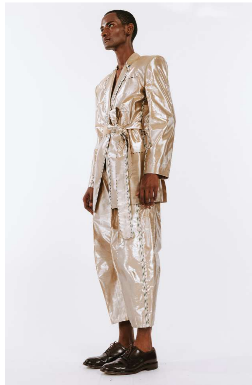
RADIATING JEWELS SIGNATURE SUIT

JACKET - R35 100,00 TROUSERS - R19 000,00