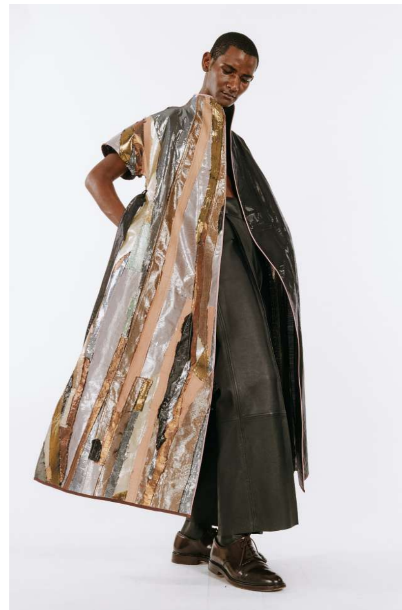
FRAGMENT OF LIGHT LOOK DRESS - R35 400,00