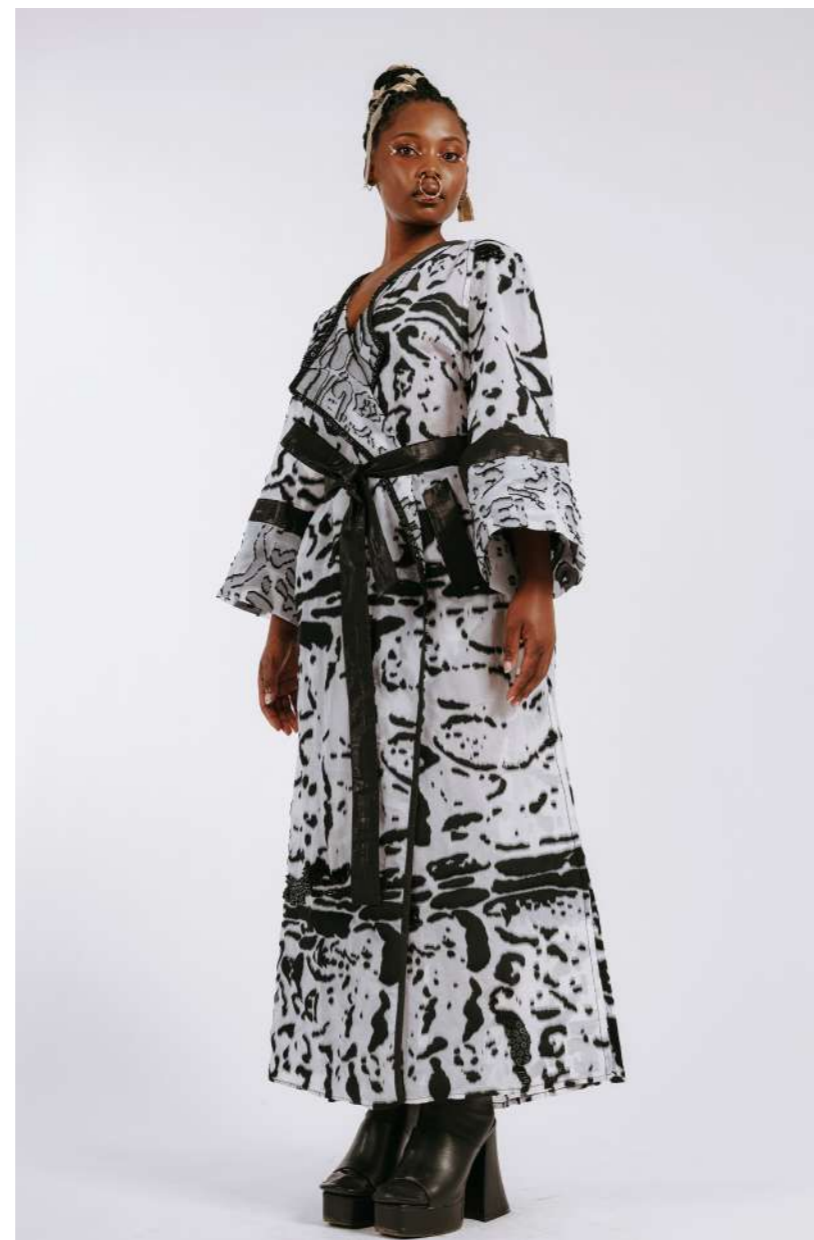
STONE CIRCLE MESSAGES LOOK DRESS - R39 100,00