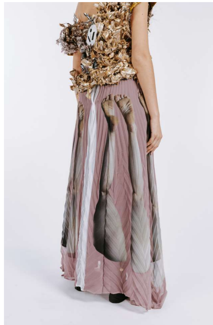
LIQUID MAHOGANY CLAY LOOK