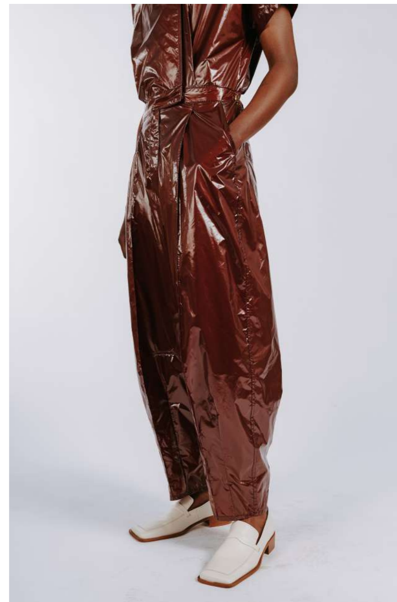
LIQUID MAHOGANY CLAY LOOK