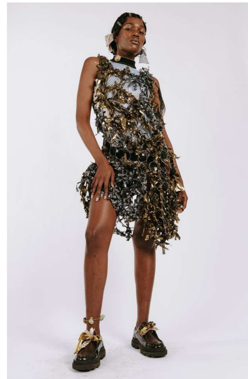
HAND CROCHET ASTEROID LOOK