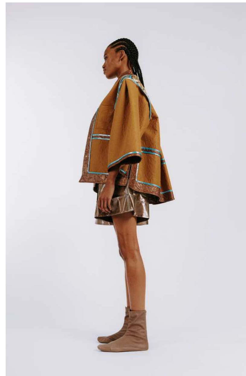
BRONZE TOPAZ LOOK