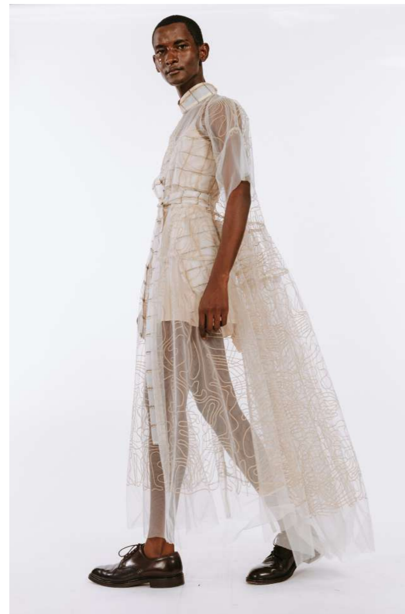
TRANSIENT PATTERN LOOK DRESS - R43 200,00