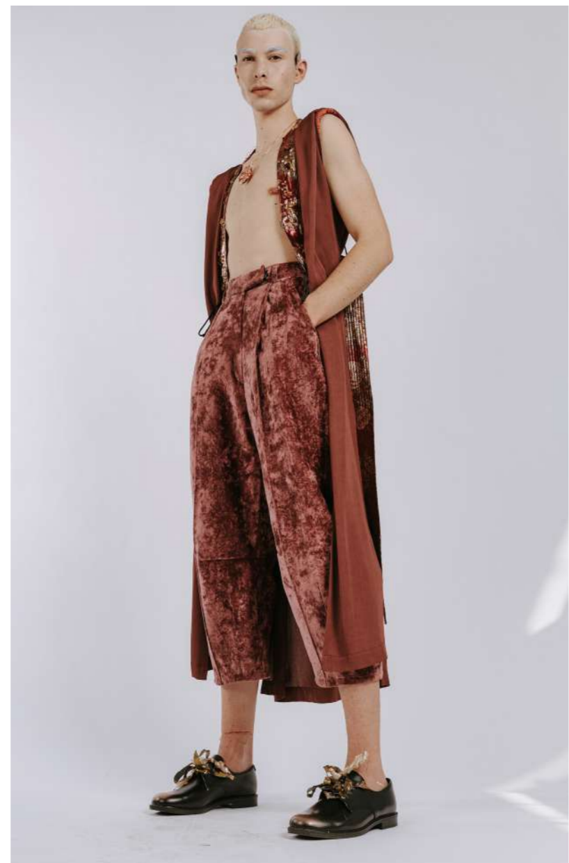
HAND BEADED PRICELESS JEWEL LOOK