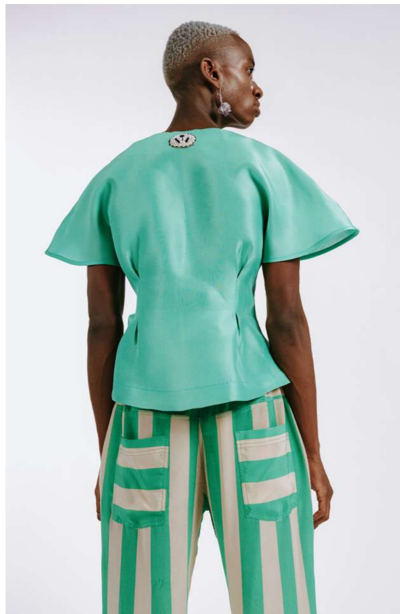
TRILLIANT CUT LOOK TOP - R19 200,00 TROUSERS - R17 000,00