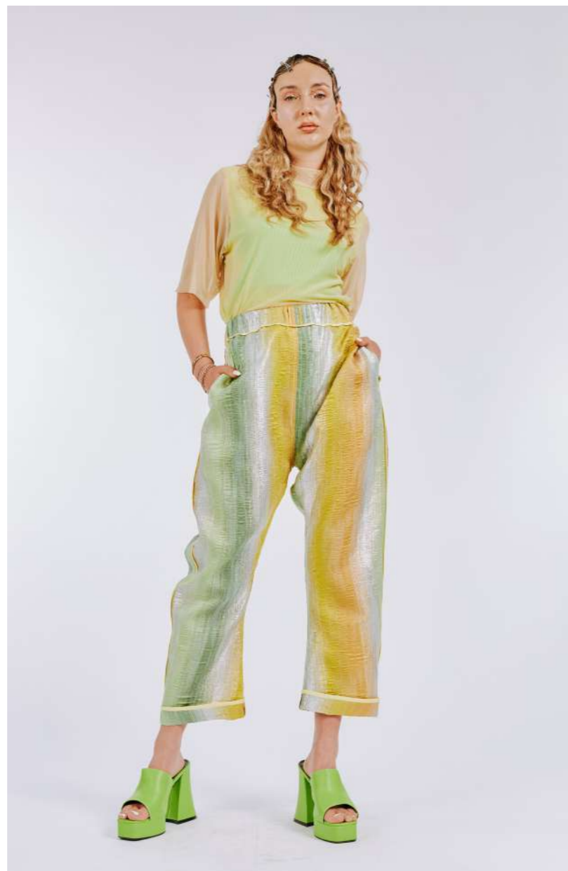
LUMO GOLDEN HOUR LOOK