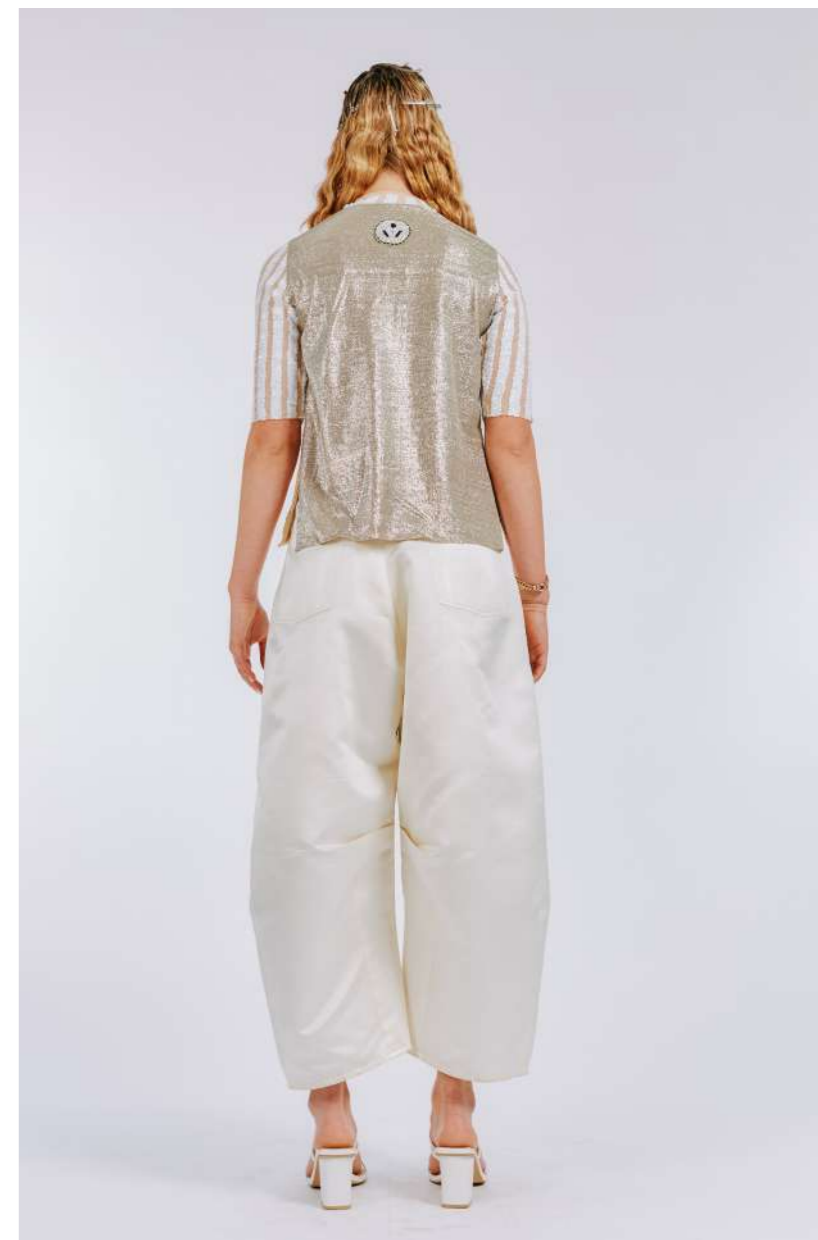
SILK OF EARTH LOOK TOP - R10 600,00 TROUSERS - R15 500,00