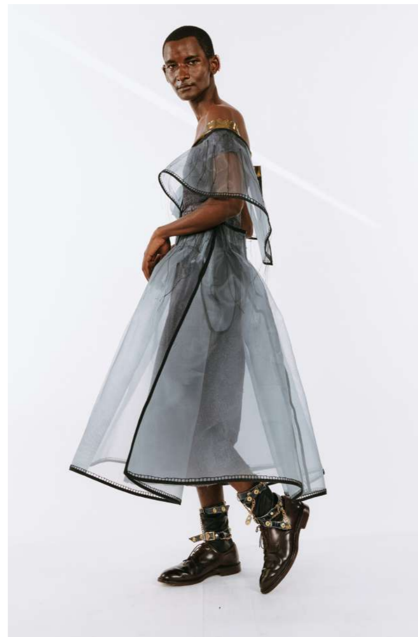
GALVANIZED LOOSE THREADS LOOK DRESS - R38 000,00