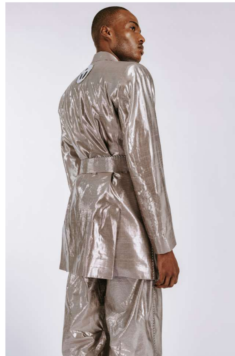
SILVER MOON SIGNATURE SUIT JACKET - R35 100,00 TROUSERS - R19 000,00