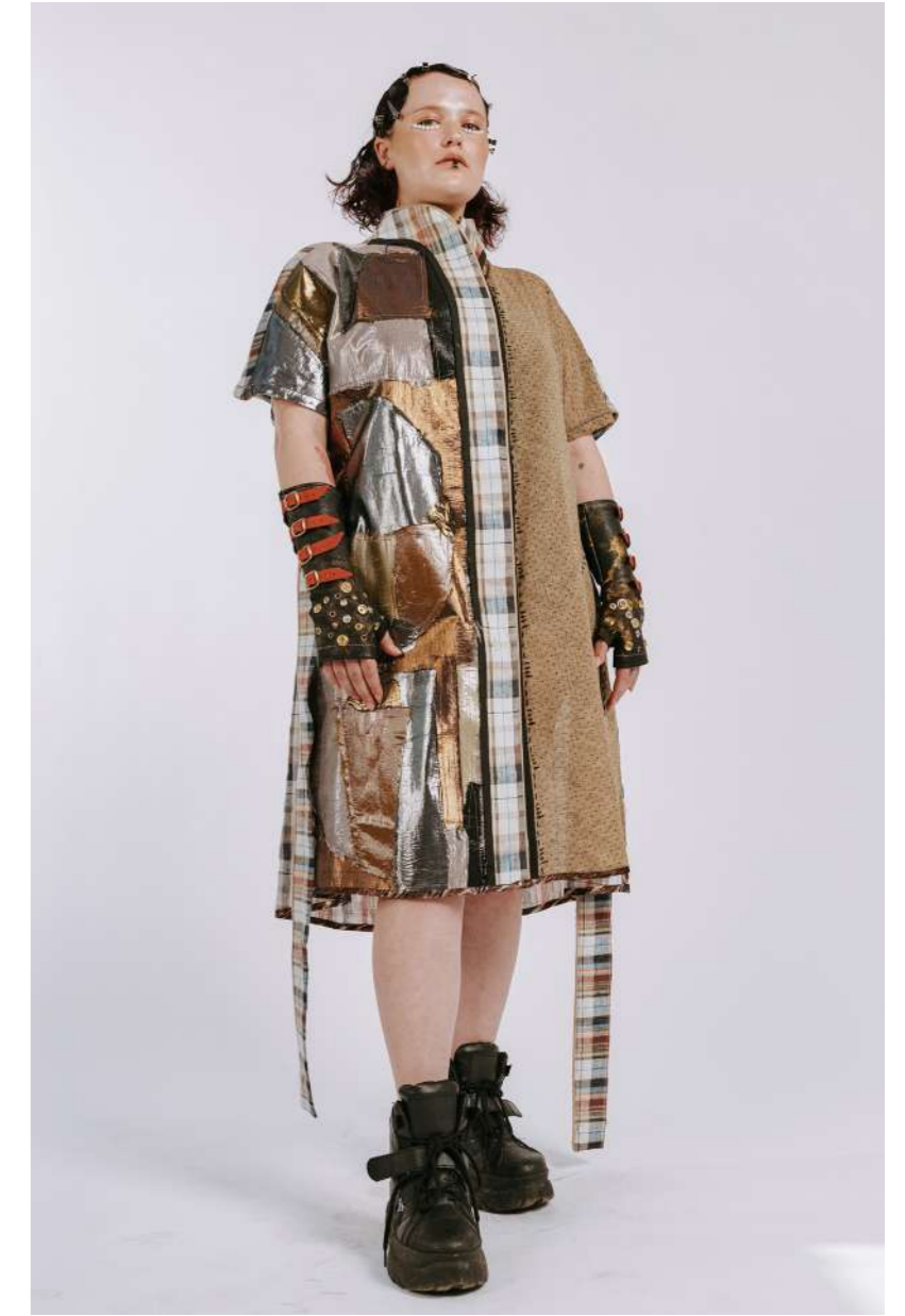
FRAGMENTED CURRENTS LOOK DRESS - R28 300,00