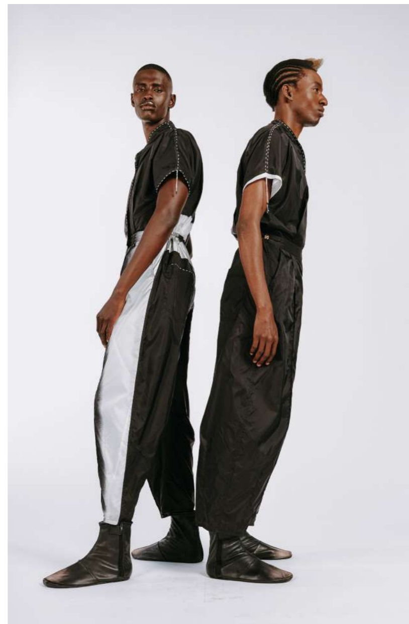
SILICA AND QUARTZ HAND EMBROIDERED LOOK JUMPSUIT - R39 000,00