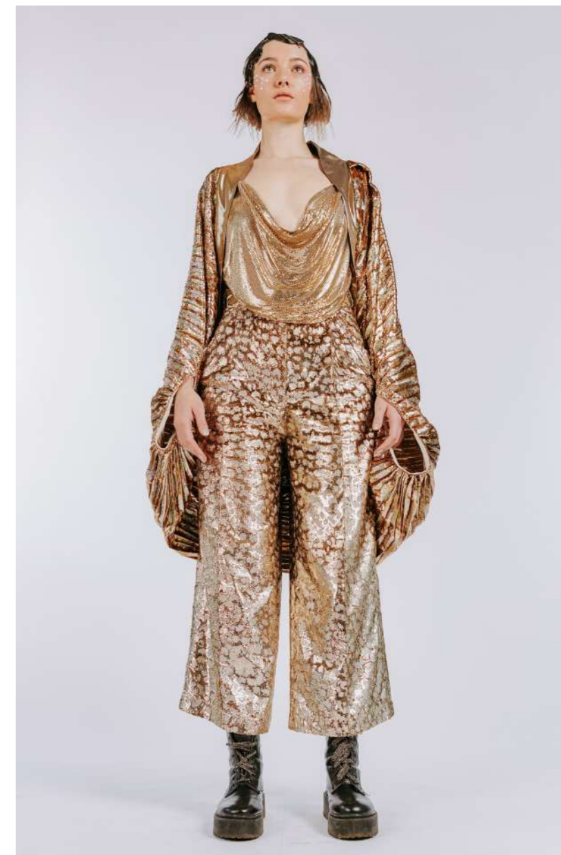
SCINTILLATING CREVICE LOOK TOP - FOR STYLING PURPOSES ONLY COAT - R21 900,00 TROUSERS - R23 500,00