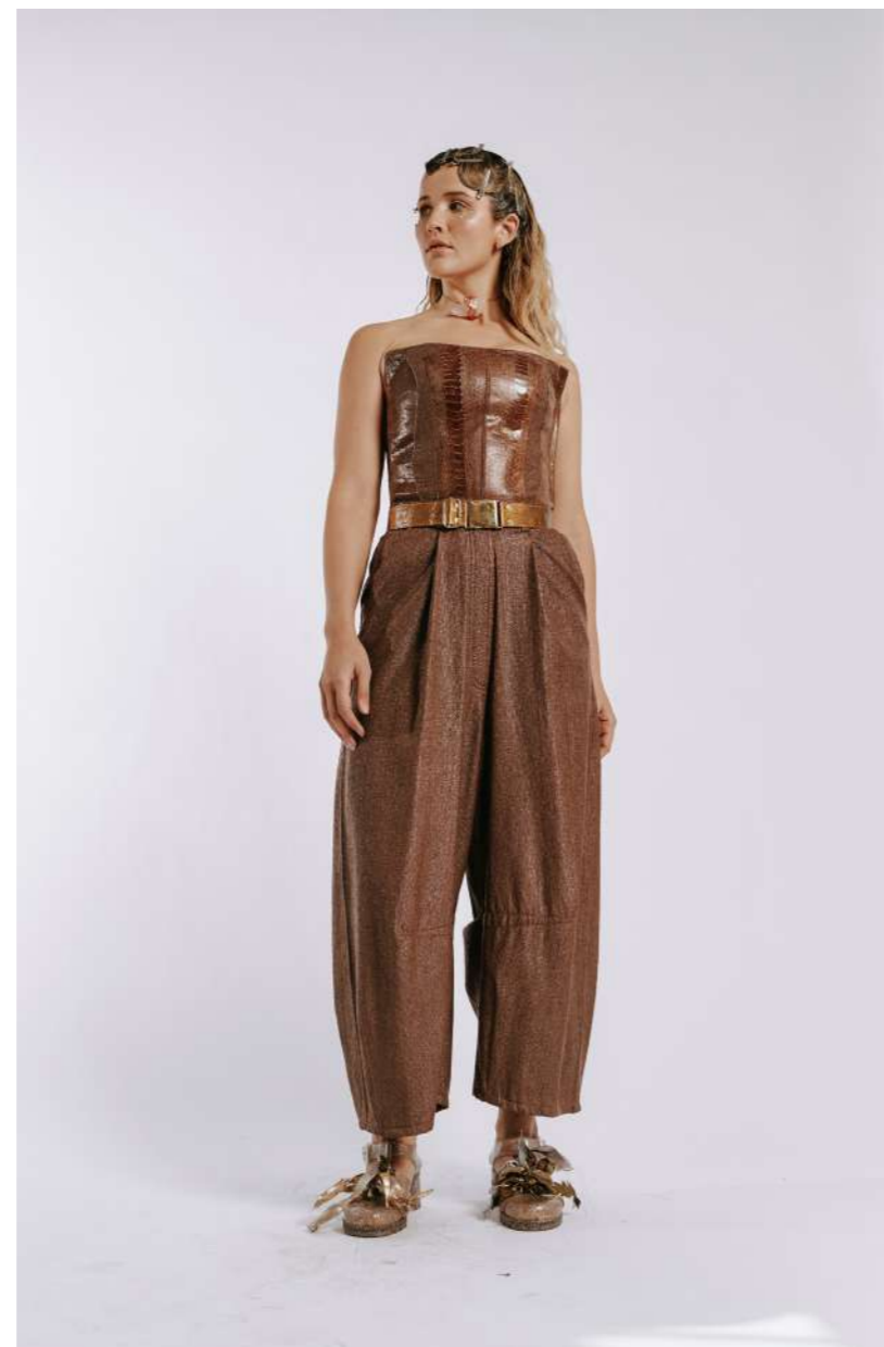
MANTLE EARTH LOOK JUMPSUIT - R37 500,00