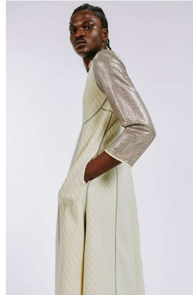
PLEIADIAN EMPIRE LOOK DRESS - R21 900,00