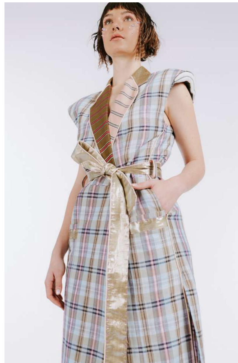
COSMIC GRID LOOK DRESS - R30 700,00