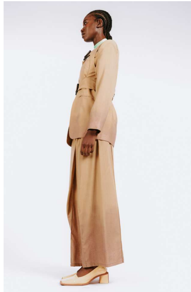
KAOLIN TAILORED LOOK LEOTARD - R6 900.00 HARNESS - R29 000.00 TROUSERS - R17 500.00