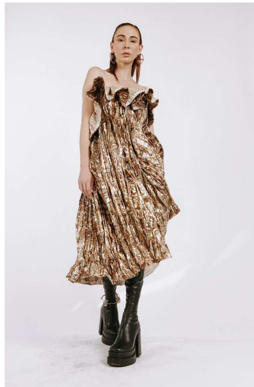
MOLTEN ROCK LOOK