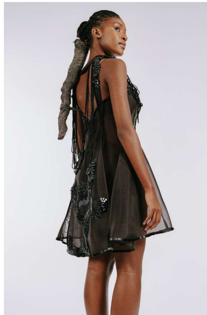
HAND ENCRUSTED SCULPTED LOOK DRESS - R148 000,00