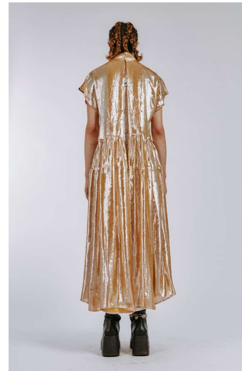
RADIANT GOLD LOOK DRESS - R39 600,00