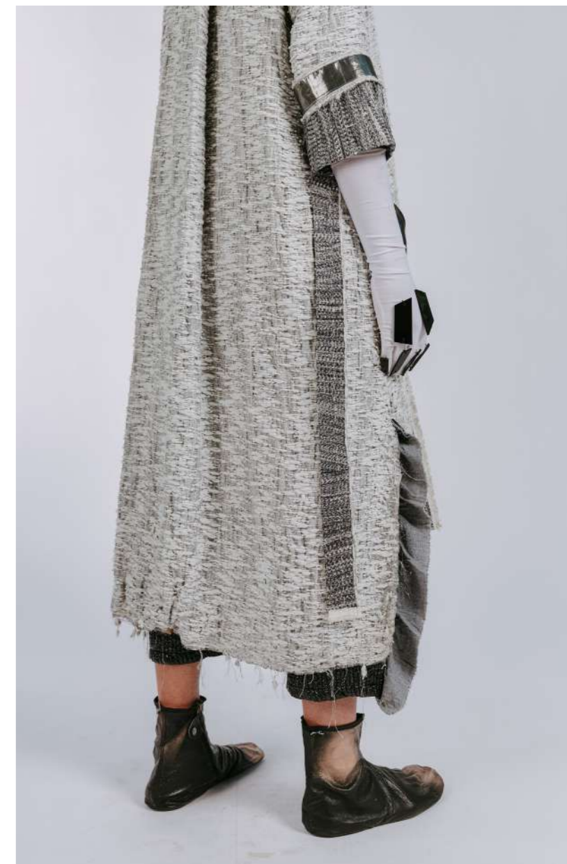
STONE CIRCLE MESSAGES LOOK COAT - R17 500,00