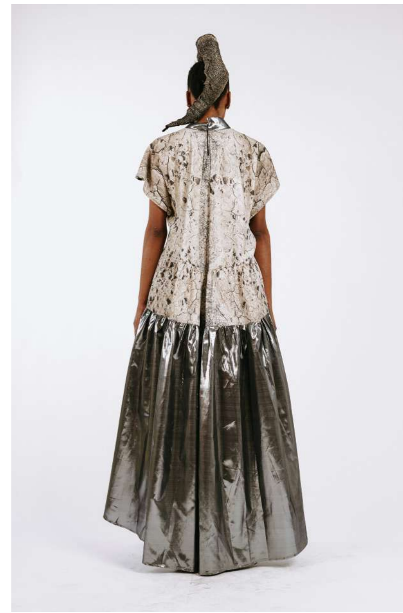
MINERAL SOIL PRINTED LOOK DRESS - R24 400,00