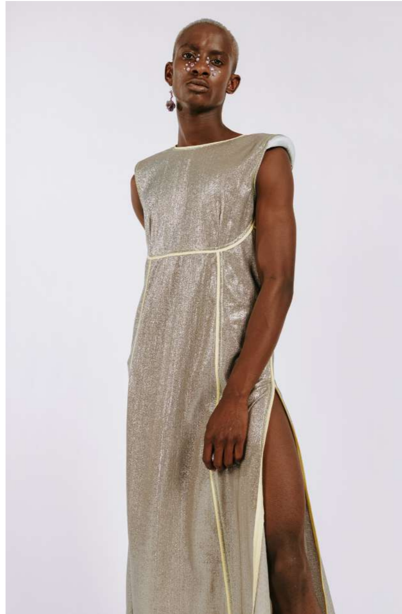
STAR SEED EMPIRE LOOK DRESS - R25 900,00