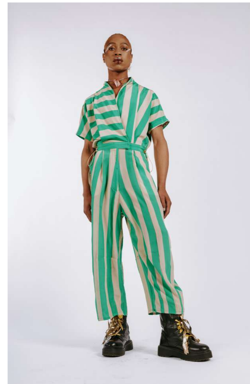
STALACTITE TOWER LOOK JUMPSUIT - R39 000,00