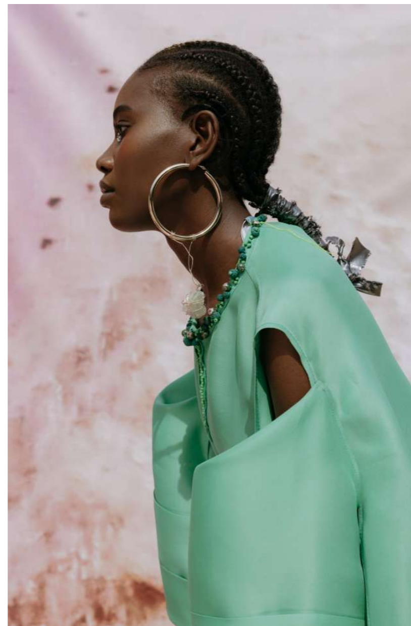
HAND ENCRUSTED GIADA LOOK DRESS - R35 900.00