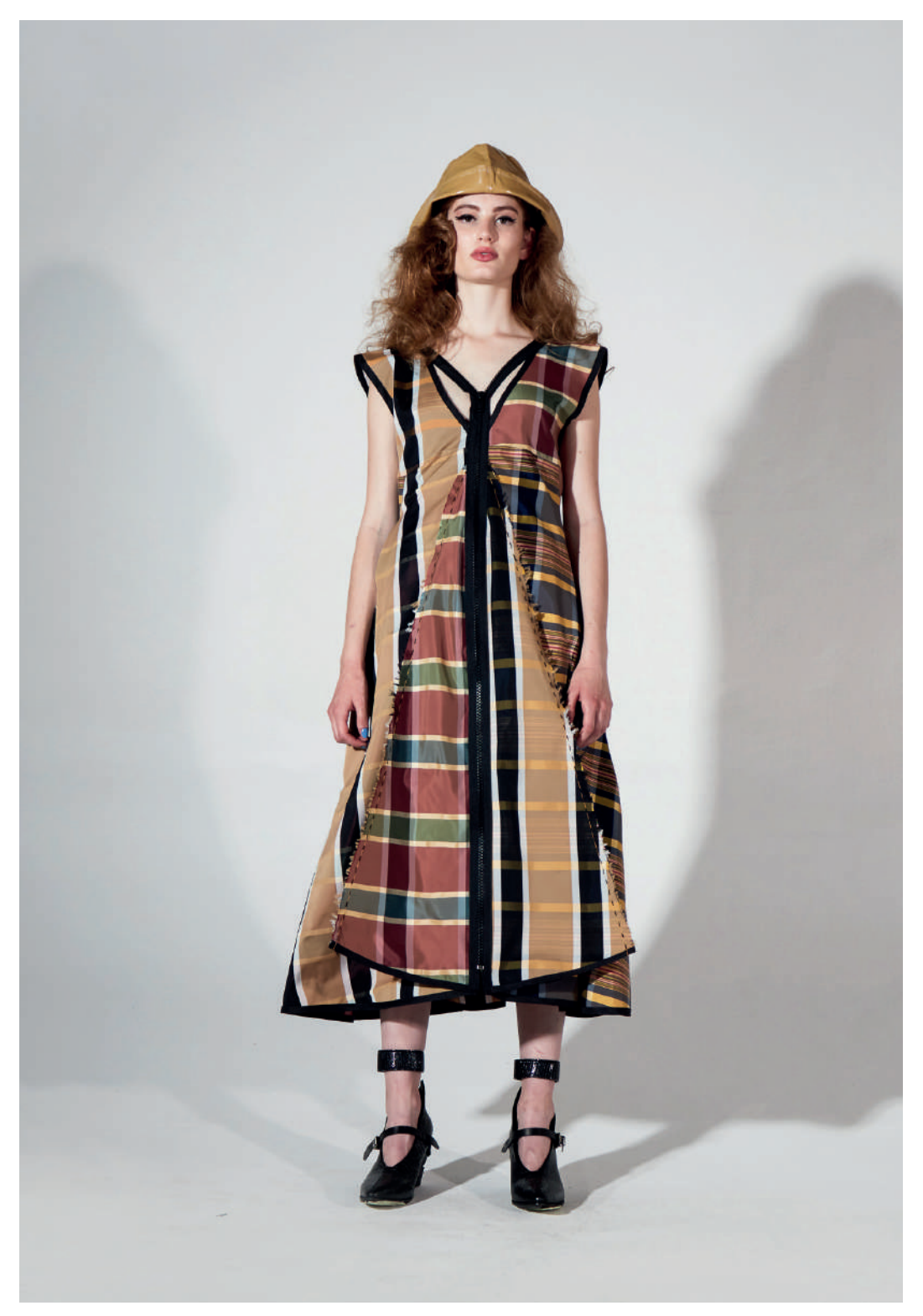
VIV 25 RUBIX CUBE Y ZIPPER DRESS