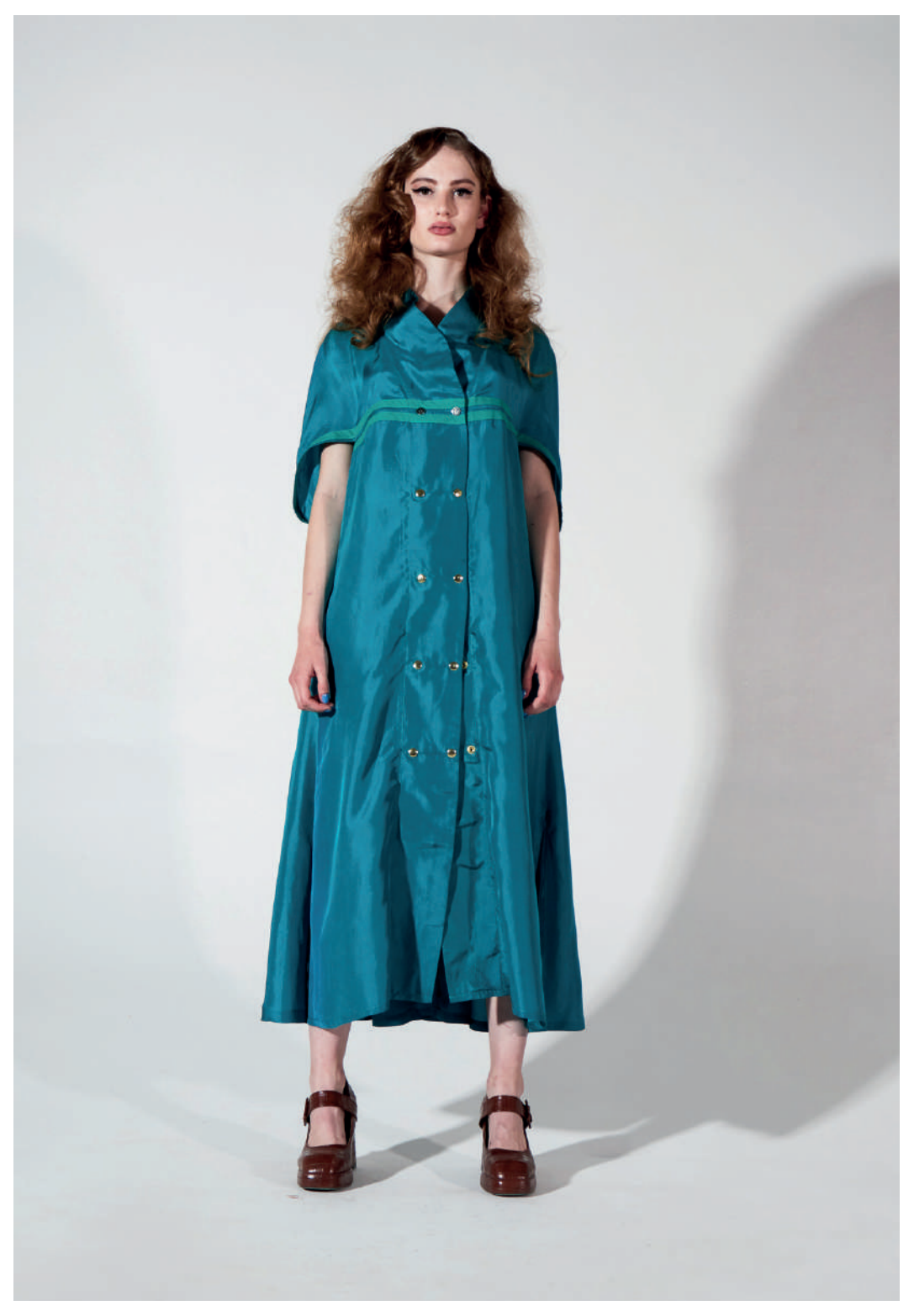
VIV 27 PSYCHIC CYAN SILK CAPE DRESS