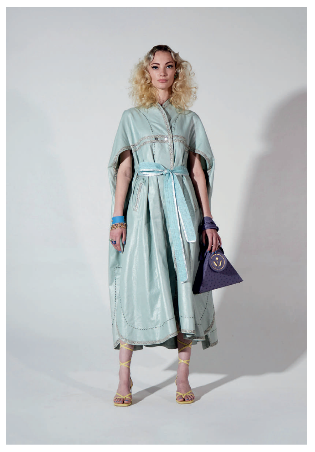
VIV 18 CRYSTAL CLEAR CLOUD DRESS GENUINE EXOTIC LEATHER PYRAMID BAG