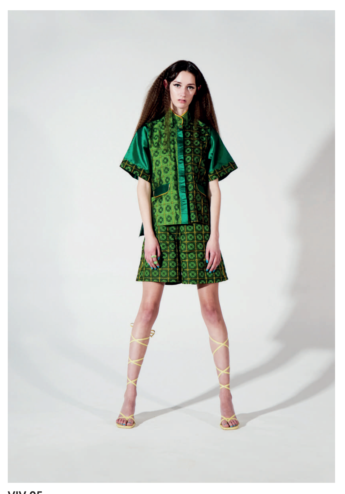
VIV 05 AURIC MATERIAL GUIDE SHIRT AURIC MATERIAL GUIDE SHORTS