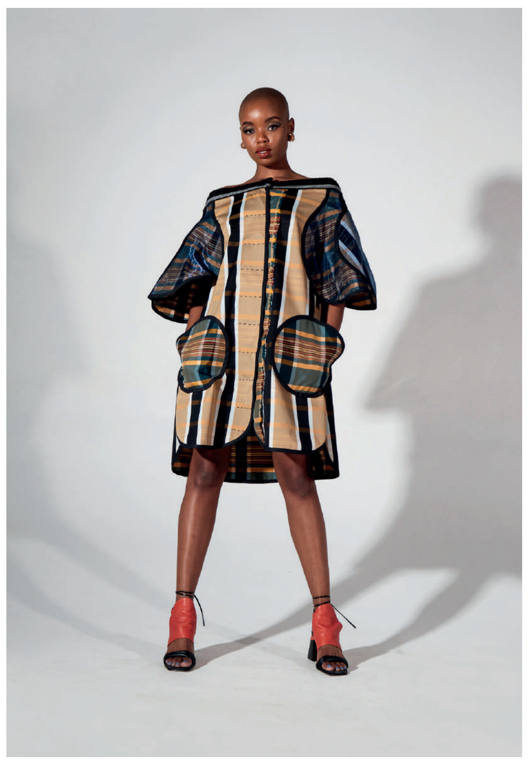
VIV 22 PIXEL PARTICLE SILK TAFFETA MINI DRESS