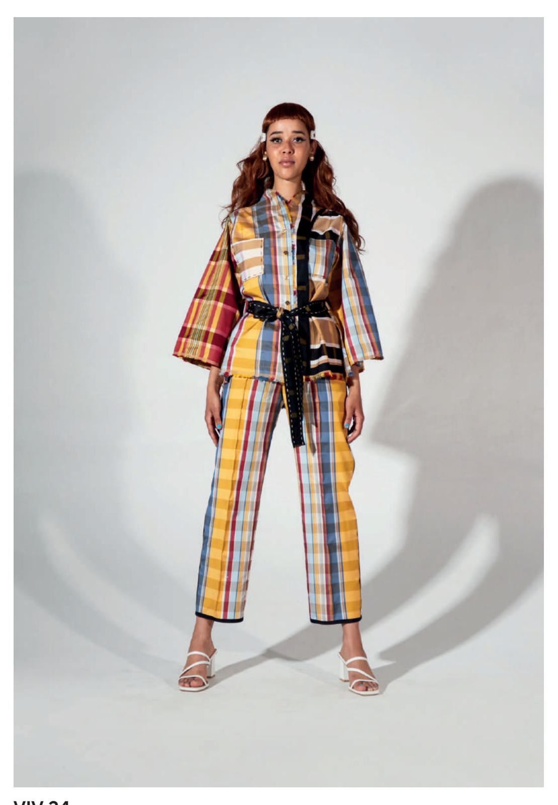
VIV 24 REVERSIBLE RUBIX CUBE QIPAO SHIRT RUBIX CUBE STRAIGHT PANTS