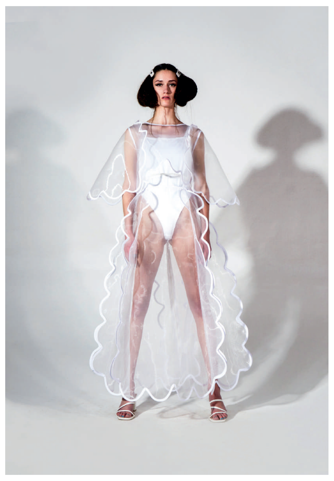
VIV 15 BRILLIANT CLOUD NYLON TOP BRILLIANT CLOUD NYLON SKIRT