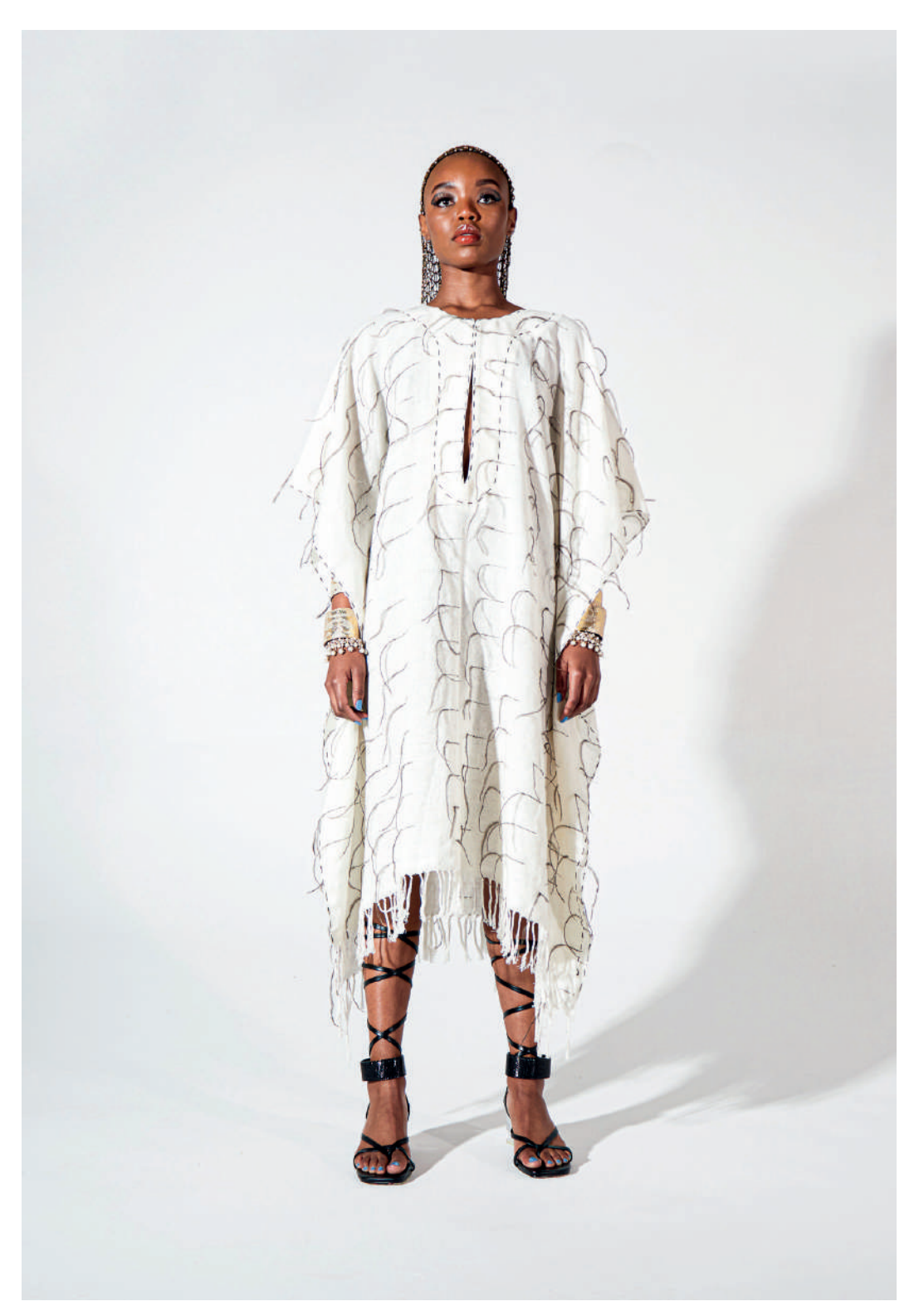
VIV 16 FLUE FEATHERED HANDWOVEN KAFTAN