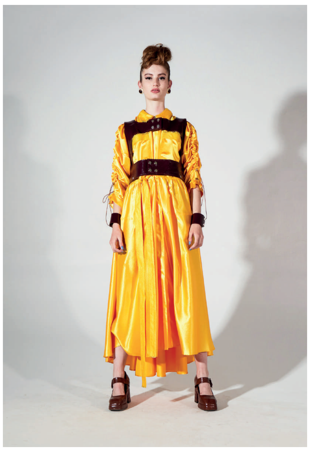
VIV 28 DEADSTOCK JAPANESE NYLON SUNSHINE UTILITY DRESS SIGNATURE VIVIERS HARNESS