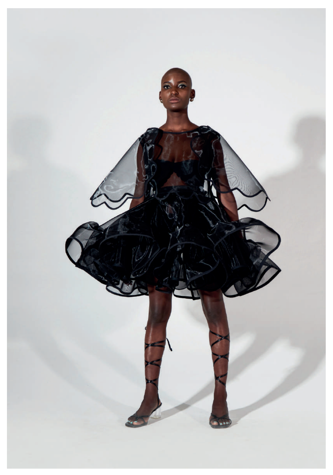
VIV 11 GLOOMING CLOUD NYLON TOP GLOOMING CLOUD NYLON SKIRT