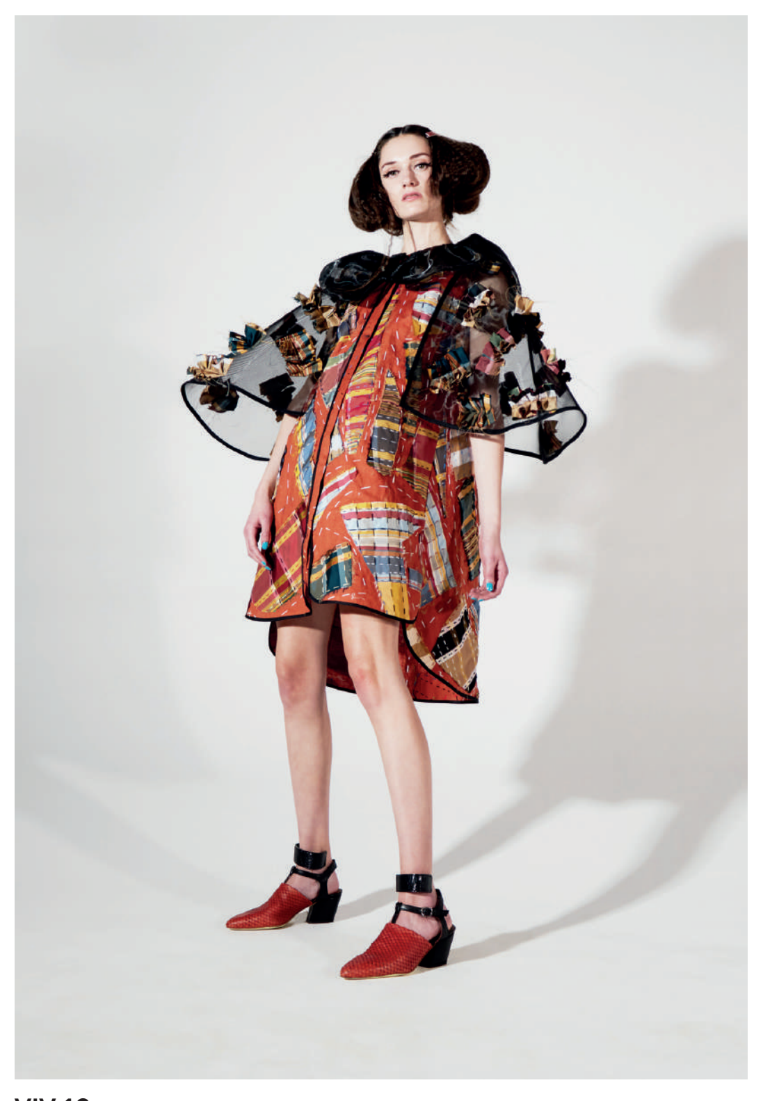
VIV 12 UP-CYCLED, PATCHWORK KOOKY DRESS WITH HAND EMBROIDERY