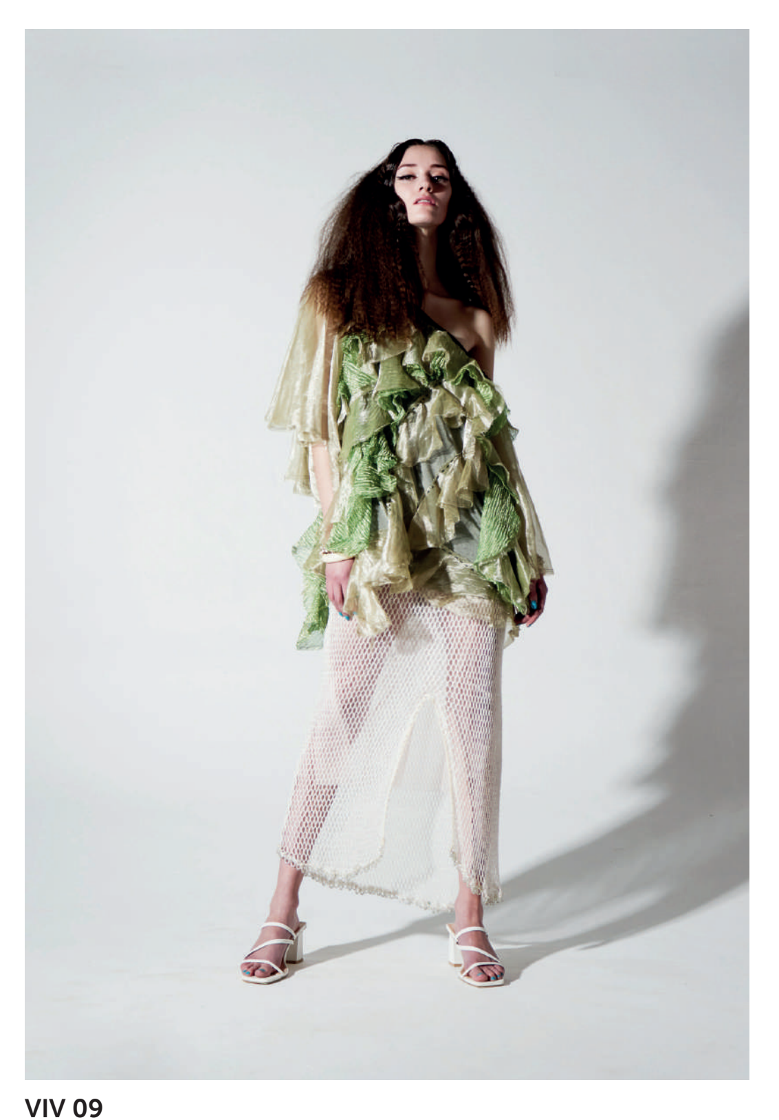
FEATHERED FLATTERED FLOPPY THISTLE SHIRT