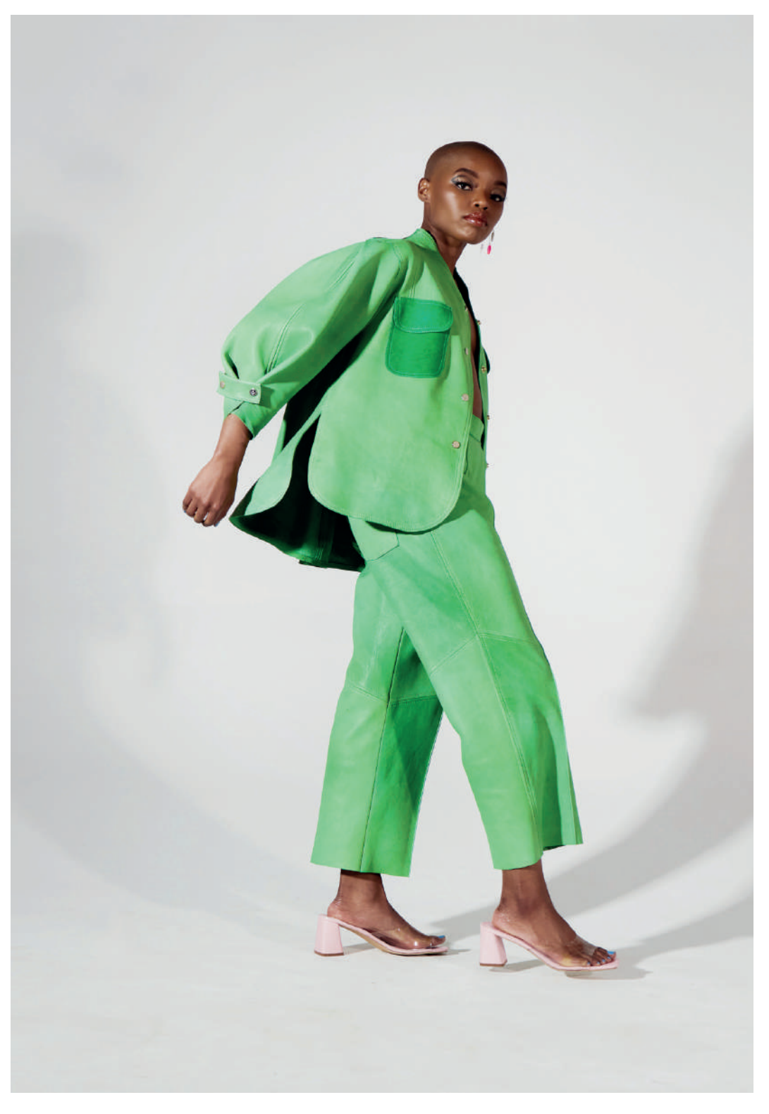
VIV 02 GLIMMERING GREEN SHIRT GLIMMERING GREEN PANTS