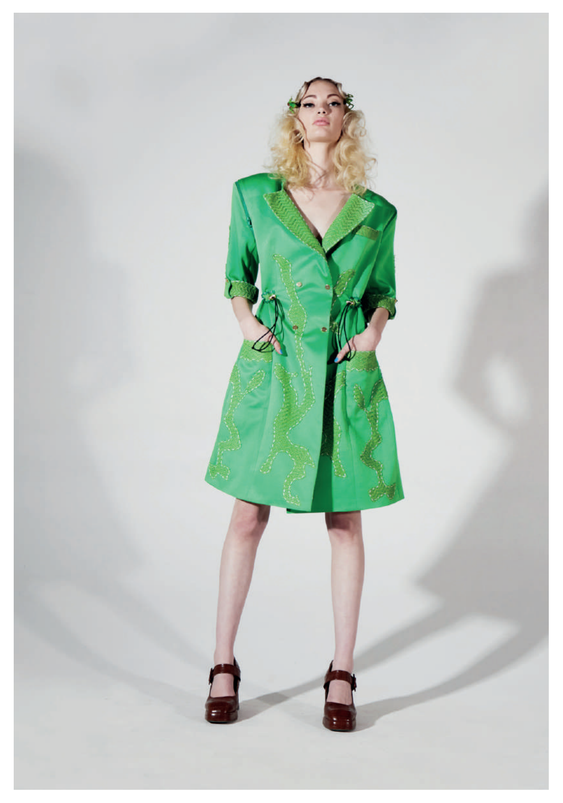
VIV 01 SHIMMERING SHAMROCK DRESS