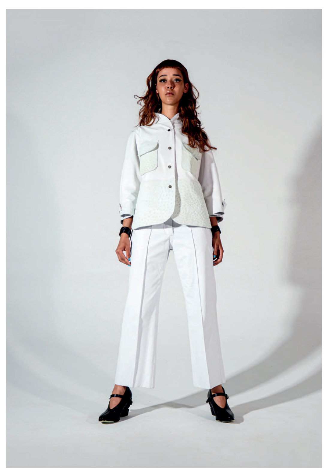
VIV 17 LUMINANCE LEATHER SHIRT LUMINANCE LEATHER PANTS