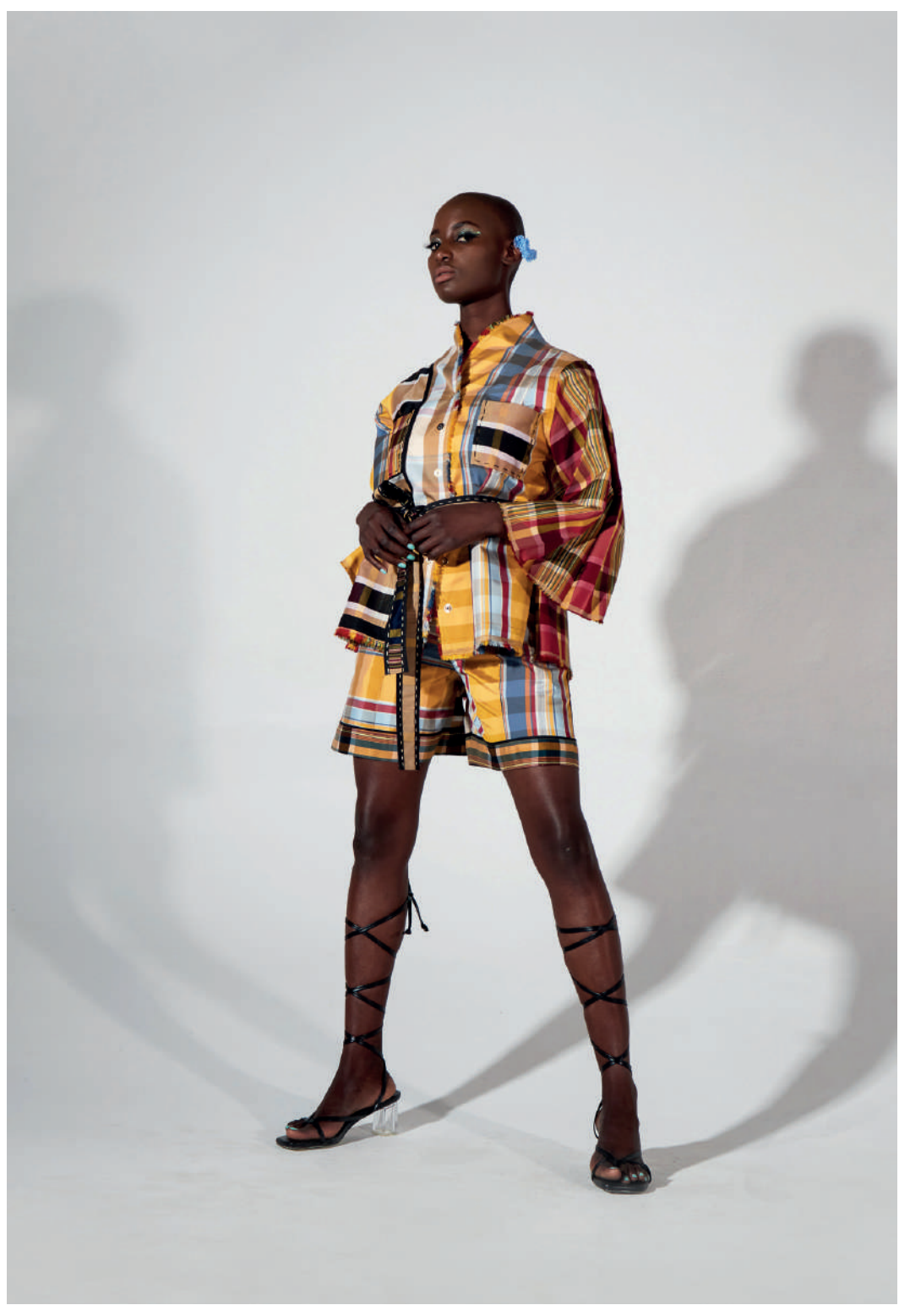
VIV 21 REVERSIBLE RUBIX CUBE QIPAO SHIRT RUBIX CUBE SHORTS