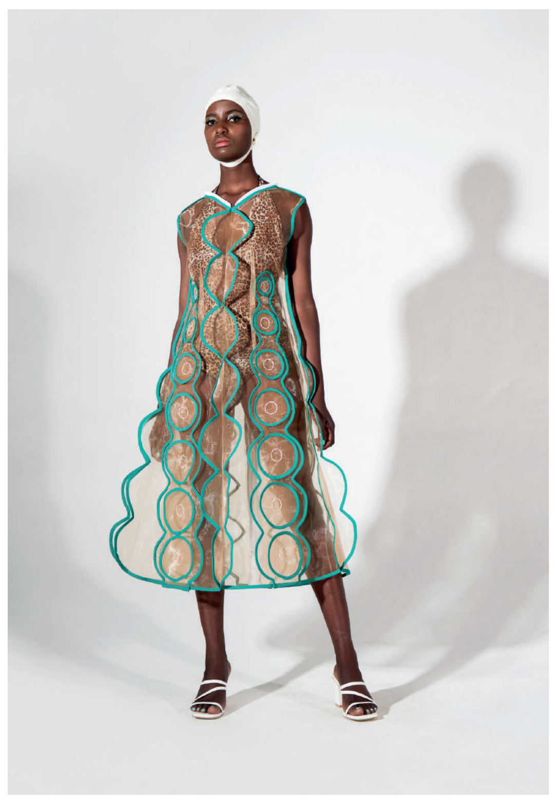
VIV 14 AURIC BUBBLE NYLON DRESS