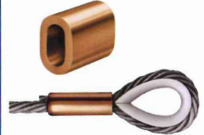
Copper ferrule (TCU)