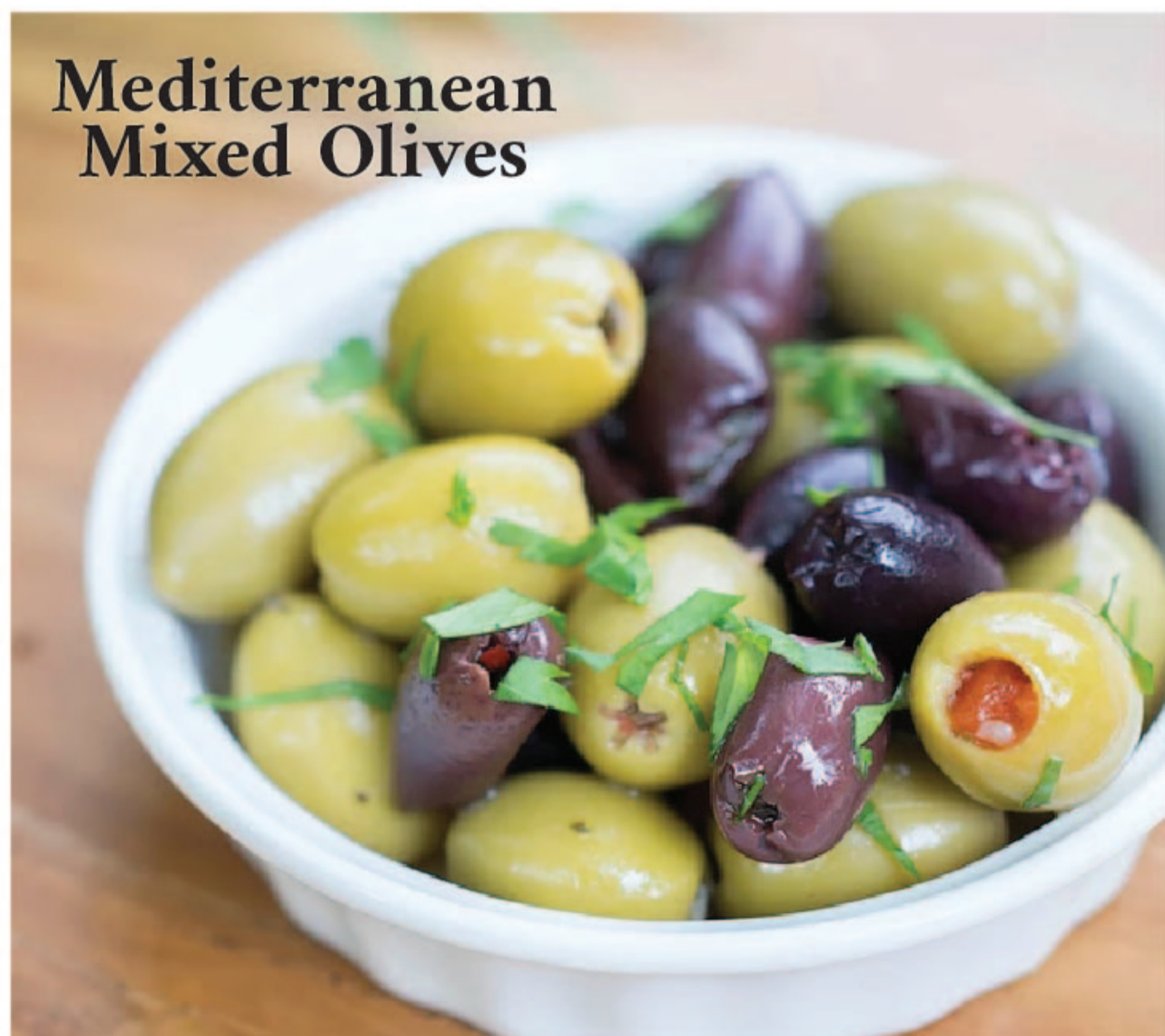
Mediterranean Mixed Olives