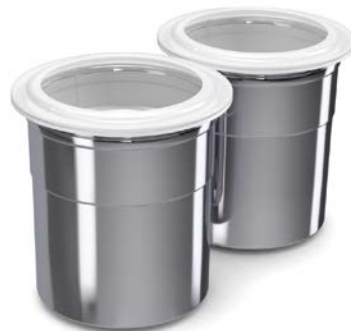
2 Chrome steel cups with sealing cap