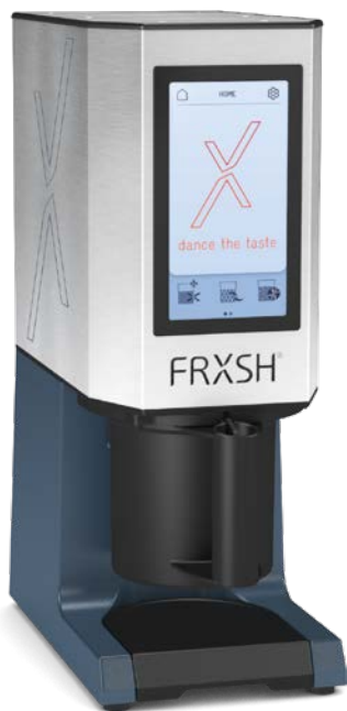
FRXSH Mousse Chef with protective beaker