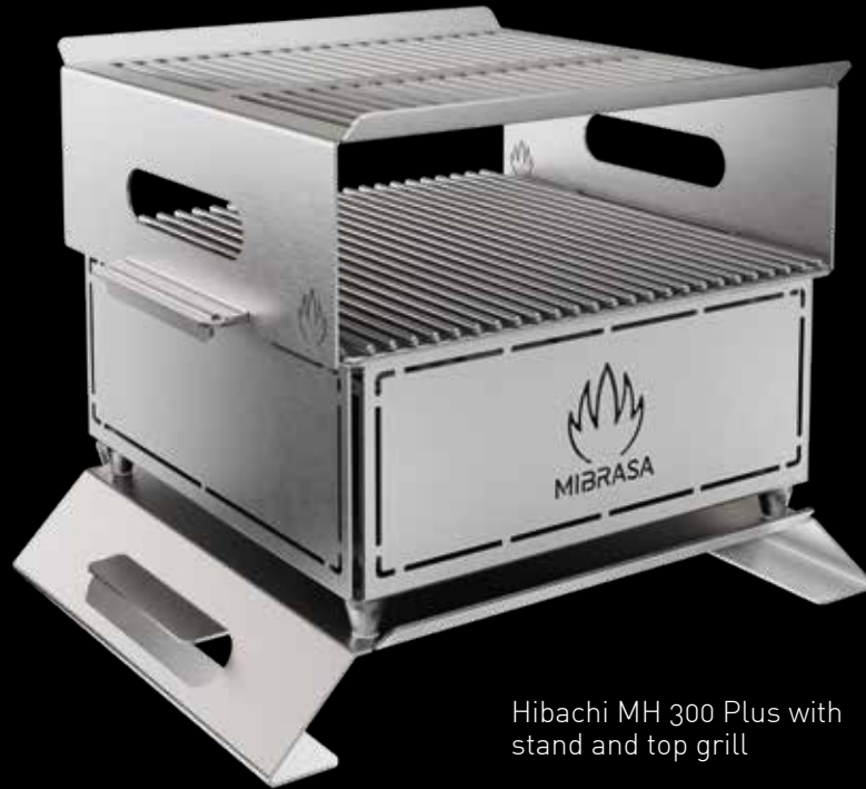
Hibachi MH 300 Plus with stand and top grill

The imagination and creativity of the chef with the Mibrasa® Hibachi know no limits!